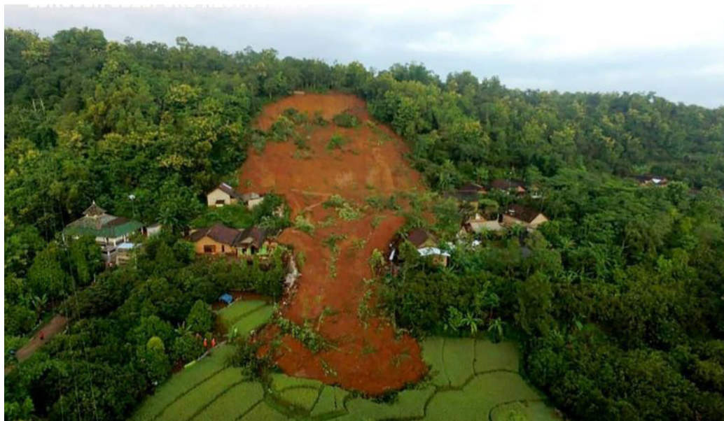
Twenty-one people were initially reported missing, but three individuals were rescued after the disaster in a rural part of East Java