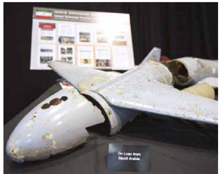
A Houthi drone shot down by Saudi air defenses

The latest announcement by the Coalition marks the sixth such attack in five days, all of which the Houthis say struck an air field or base in southern