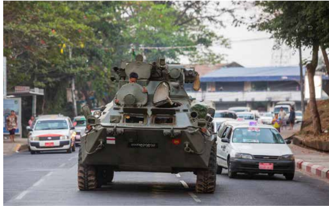
An armoured vehicle rides on a street during a protest against the military coup, in Yangon, Myanmar

On Monday, security forces used rubber bullets and catapults in the city of Mandalay, wounding