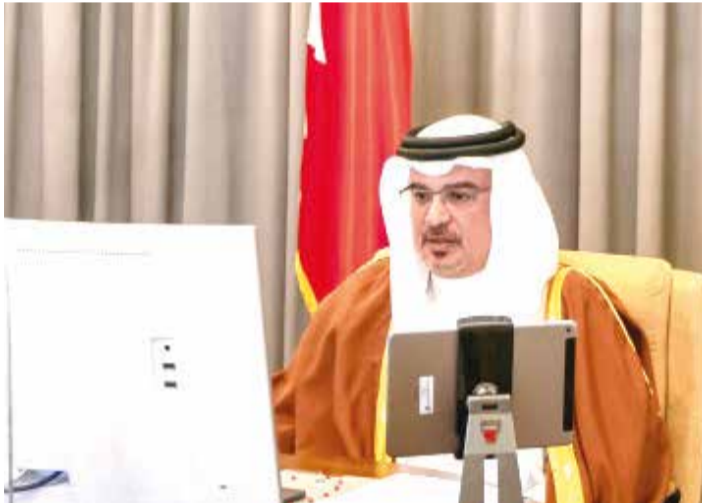
HRH Prince Salman during the remote session

The Cabinet said that the series of attacks in recent weeks endangered the lives of innocent