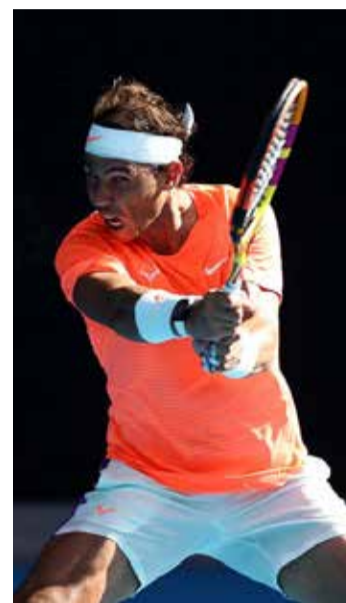
Rafael Nadal in action