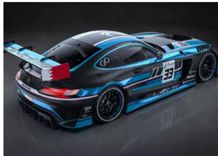
A computer-generated image of the new Mercedes-AMG GT3 car of 2 Seas Motorsport

Since then, the 2021 season has started in winning ways with HH Shaikh Isa part of the driver line-up which claimed victory at the Gulf 12 Hours Bahrain last month.