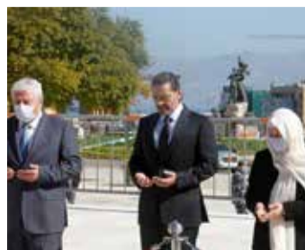
16th anniversary of Lebanon's former Prime Minister Rafik al-Hariri assassination

A UN backed tribunal in December convicted a Hezbollah