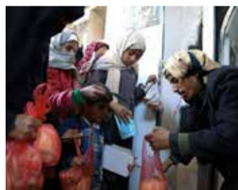
March 1, the four sources said, but the target amount and plans have yet to be finalised. Saudi Arabia co-hosted last year's fundraiser.

The proposed date for the new donors conference is