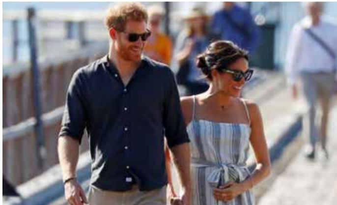
Britain's Prince Harry and Meghan arrive to greet members of the public

"We can confirm that Archie is going to be a big