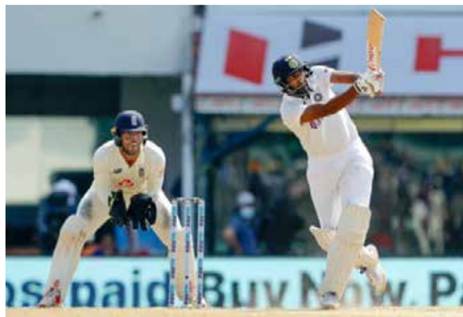
Ravichandran Ashwin hits to the boundary during his century