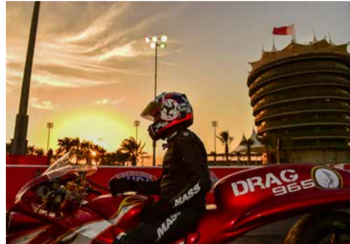
A competitor in a motorbikes class on the drag strip

Mahmood Mohammed won the Outlaw 4 category with a time of 10.508s at 205.61kph to