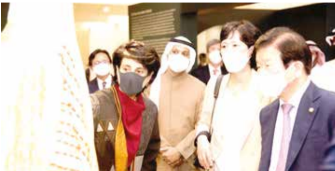
Speaker Park visits the Bahrain National Museum, along with a South Korean parliamentary delegation

The meeting with HM the King stressed the importance of cooperation between Bahrain and Asia in general and South Korea in particular, he said, adding there is ongoing cooperation in the field of construction and infrastructure.