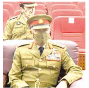
Lt. Gen. Al Nuaimi tours the premises

Chief-of-Staff Lieutenant-General Theyab bin Saqr Al Nuaimi toured the premises where he was briefed on