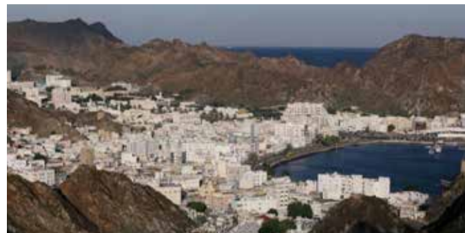
General view of old Muscat