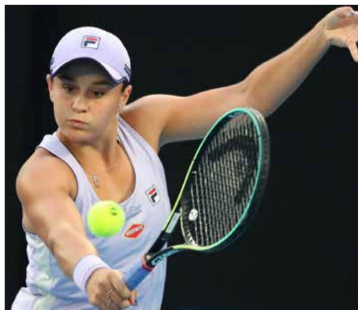
Australia's Ashleigh Barty in action

front of empty stands, top-ranked Barty beat big-hitting American Shelby Rogers in impressive fashion to reach the last eight.