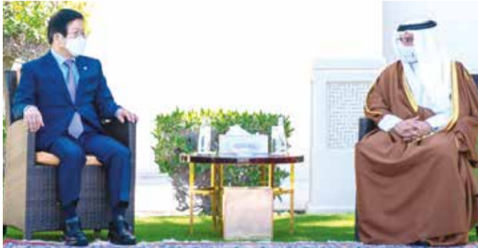
HRH the Crown Prince and Prime Minister receives Speaker Park

During his visit to the Kingdom, Park met HM the King, HRH the Crown Prince and Prime Minister, the Speaker of the Council of Representative and the Chairman of the Shura Council.