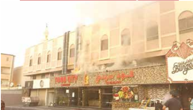
Civil defence extinguished a fire in a restaurant in Riffa. No injuries were reported. Accumulated oil inside the chimney was the reason behind the fire.