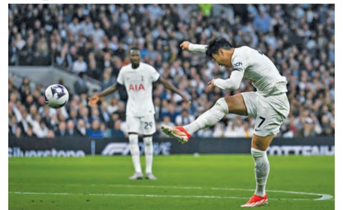
Tottenham Hotspur's South Korean striker Son Heung-Min shoots the ball