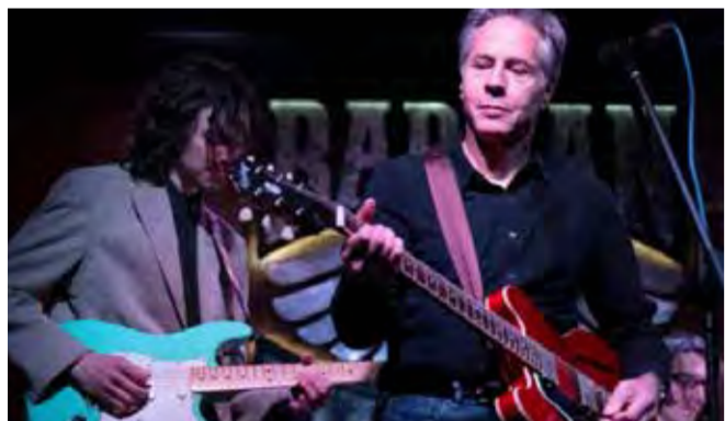
Blinken took to the stage of a Kyiv bar on Tuesday