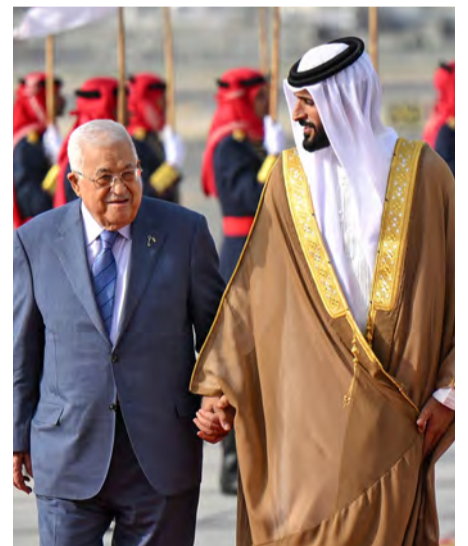
His Highness Shaikh Nasser bin Hamad Al Khalifa, HM the King's Representative for Humanitarian Work and Youth Affairs, with Palestinian President Mahmud Abbas.

human rights, and governance are likely to reflect evolving dynamics across the Arab world.