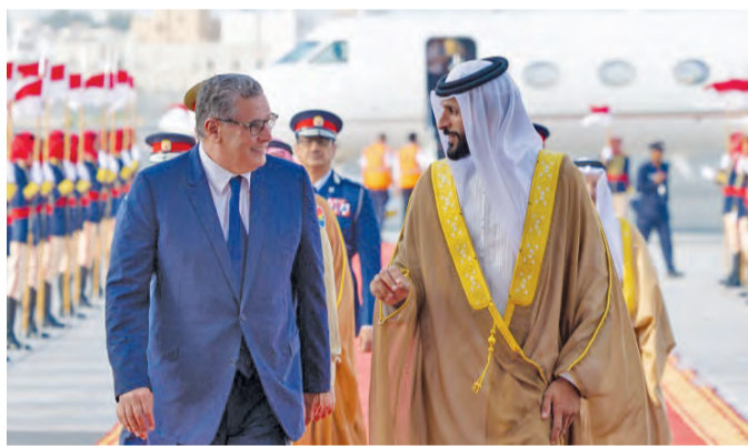
Morocco Prime Minister Aziz Akhannouch with HH Shaikh Nasser bin Hamad Al Khalifa

This special version will be available for a limited time, and those wishing to acquire it should go to the mentioned sites within the official working hours from 7 a.m. to two in the afternoon, and for more information, please visit our website www.mtt.gov.bh .