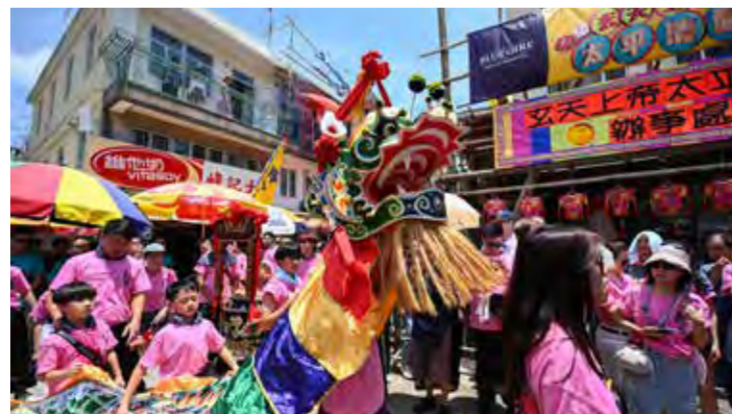
Performers participate in the "Piu Sik" parade on the island of Cheung Chau during its annual Bun festival in Hong Kong

Supporting costumes ranging from Cinderella dresses to Dragon Ball Z outfits, children were hoisted onto metal poles as unofficial mascots of a boisterous parade as Hong Kong celebrated its annual bun festival yesterday. Thousands of visitors flocked to Hong Kong's outlying island of Cheung Chau to watch the "Piu Sik" or floating colours parade, which used to be performed with statues of deities before costumed youngsters replaced them. The elaborately dressed young children were raised above the crowds for the iconic spectacle on the island, which is steeped in cultural traditions and a popular tourist destination. Temperatures soared to 29 degrees Celsius (84 degrees Fahrenheit) during the parade. "Last year I was a firefighter... I've always wanted to be a cop," "We've always had a queue