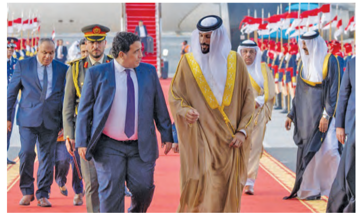
Libya President Mohamed Al Menfi with HH Shaikh Nasser bin Hamad Al Khalifa

From strengthening security cooperation to promoting economic development and addressing humanitarian crises, the summit promises to be a forum for meaningful dialogue and strategic collaboration.