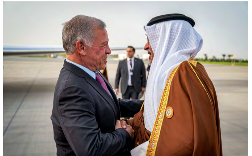
HRH Prince Salman welcomes Jordan's HM King Abdulla II.

HM King, HRH Prince Salman welcome Arab leaders for today's 33rd Arab Summit