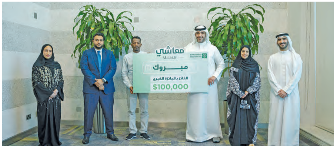
Officials and winner during the prize distribution