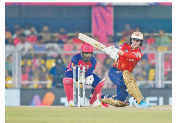
Punjab Kings' Sam Curran plays a shot