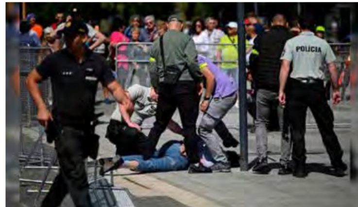
Police had detained the suspected gunman.

Slovakia Prime Minister Robert Fico was yesterday shot multiple times and rushed to hospital with life-threatening injuries after a cabinet meeting, officials said, in an attack condemned by EU chiefs. Fico, a populist leader accused of being Kremlin-friendly, has been prime minister since last year. "Today, after the government meeting in Handlova, there was an assassination attempt on the