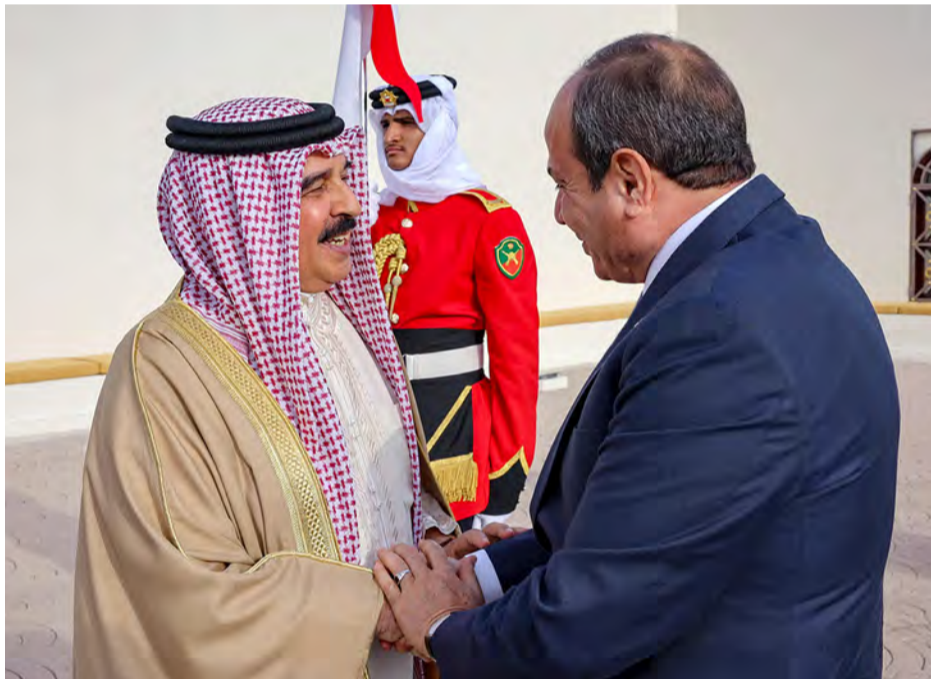
HM the King with Egypt President Abdel Fattah El Sisi.