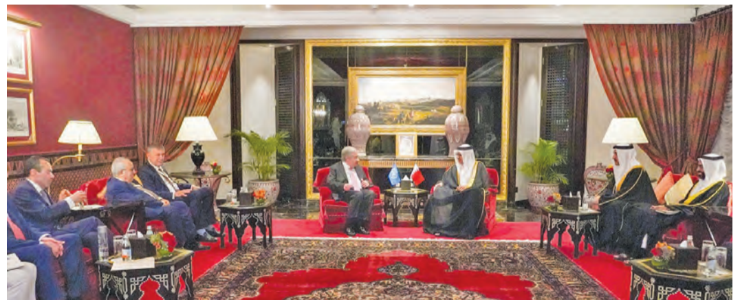
The Minister of Foreign Affairs, H.E. Dr. Abdullatif bin Rashid Al Zayani, meets the UN Secretary-General