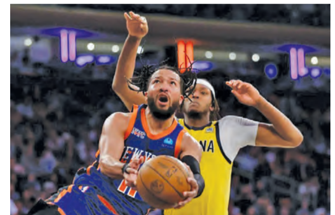
New York Knicks' Jalen Brunson in action