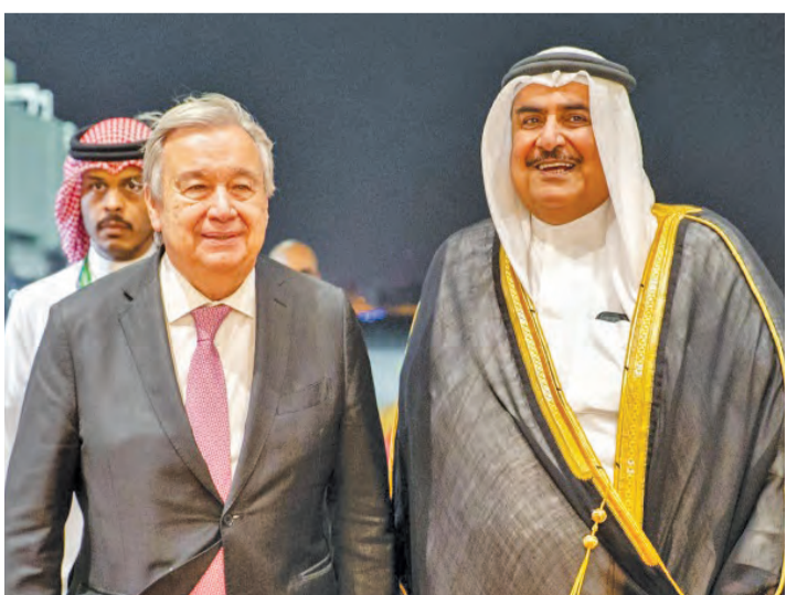
United Nations Secretary General Antonio Guterres with H.E. Shaikh Khalid bin Ahmed bin Mohammed Al Khalifa, the Advisor to His Majesty the King for Diplomatic Affairs