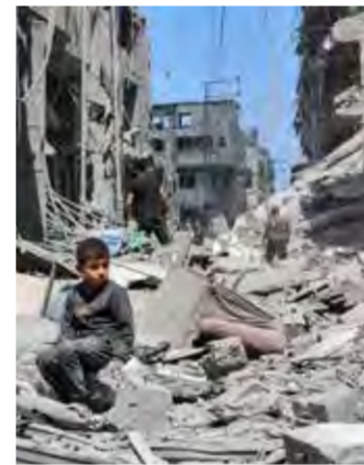
A young boy sits amid the debris of a building destroyed by Israeli bombardment in the al-Zaitoun neighbourhood of Gaza City in the northern part of the Palestinian territory

The international community, including Israel's top ally Washington, had urged Israel to refrain from launching a ground offensive in Rafah, where 1.4 million people have sought shelter. But Netanyahu insisted that "the humanitarian catastrophe that was spoken about did not materialise, nor will it". Israel last week defied a chorus of warnings -- including from the United States, which paused a shipment of bombs -- and sent troops and tanks