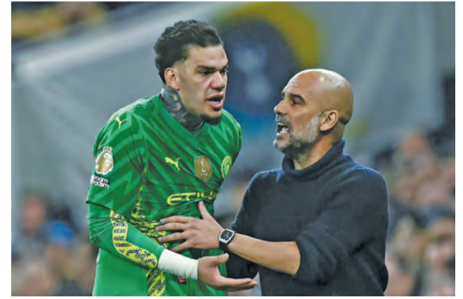
Manchester City's Brazilian goalkeeper #31 Ederson (L) argues with manager Pep Guardiola following his decision to substitute him