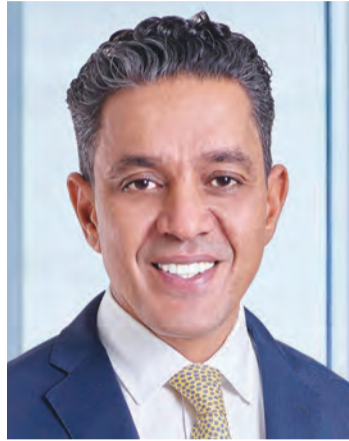
Rafik Nayed, Group CEO of Al Salam Bank

of a majority stake in Al Salam Bank-Algeria in 2023 showcasing Al Salam Bank's ability to achieve significant growth whilst ensuring a seamless cus-