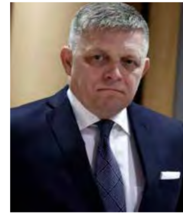
Slovakia Prime Minister Robert Fico