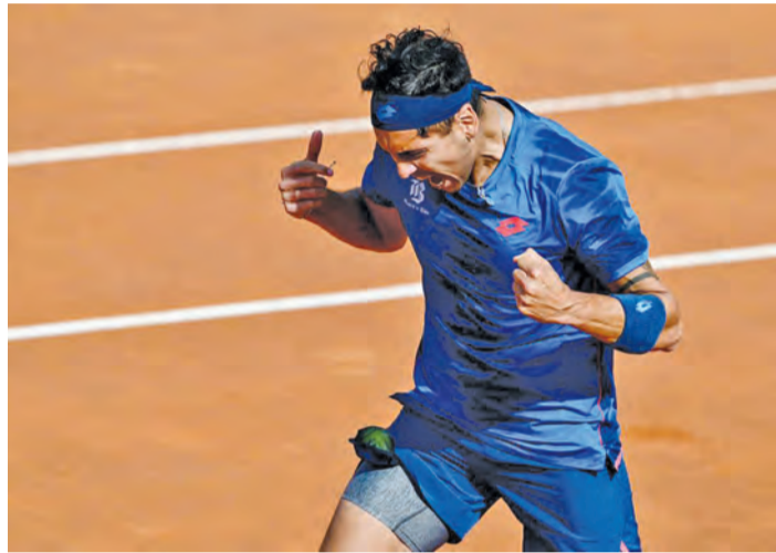
Chile's Alejandro Tabilo celebrates after winning against China's Zhang Zhizhen

"It's just unbelievable, I just can't believe it right now, still