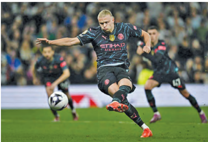
Manchester City's Norwegian striker #09 Erling Haaland shoots a penalty kick and scores his team second goal

six minutes into the second half when he tapped in from Kevin De Bruyne's pass before doubling City's lead from the penalty spot after Jeremy Doku was brought down by Pedro Porro.