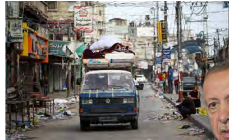
Palestinians transport their belongings on the back of a van as they flee Rafah in the southern Gaza Strip to a safer location

President Recep Tayyip Erdogan yesterday claimed that Israel would "set its sights" on Turkey if it succeeded in defeating Hamas in the Gaza Strip. Erdogan, a vocal critic of Israel's war in the Palestinian territory following Hamas's attack on October 7, has often expressed support for the Palestinian group as defenders of their homeland. "Do not think that Israel will stop in Gaza," Erdogan told his party lawmakers in the parliament in the capital Ankara.