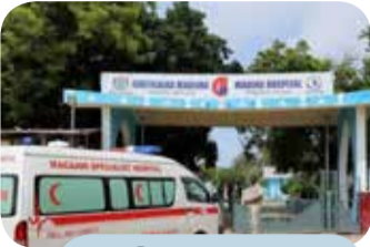
At least 15 killed in suicide bombing at army camp in Somalia

◆ At least 15 people were killed on Tuesday in a suicide bombing as recruits lined up outside an army camp in the Somali capital Mogadishu, a Reuters witness who counted the bodies at Madina Hospital said. Officials at the hospital confirmed the dead were killed in an attack earlier in the day at a checkpoint outside the General Degaban military training camp in the capital. There was no immediate claim of responsibility. Islamist group al Shabaab frequently carries out bombings in the Horn of Africa country. Dozens of people crowded outside Madina Hospital searching for their missing relatives.