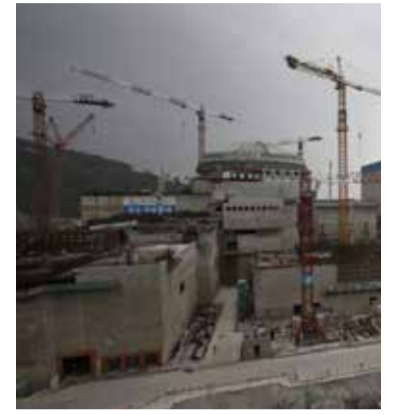
A nuclear reactor and related facilities as to be operated by China Guangdong Nuclear in Taishan, Guangdong province, October 1

CNN had reported that Framatome, the EDF unit that designed Taishan's reactors, was warning