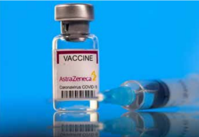
A vial labelled with the AstraZeneca coronavirus disease (COVID-19) vaccine