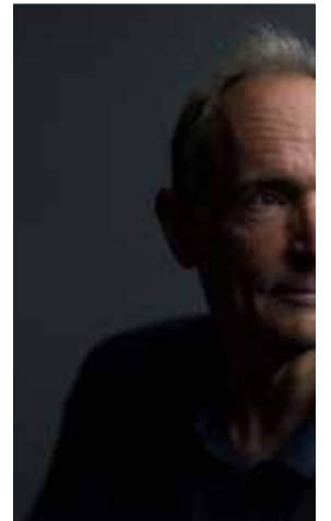
World Wide Web founder Tim Berners-Lee for a photograph following a special festival 2018 in London, Britain

Berners-Lee, a London-born computer scientist, invented the World Wide Web in 1989, revolutionising the sharing and creation of information in what is seen as one of the most significant inventions since