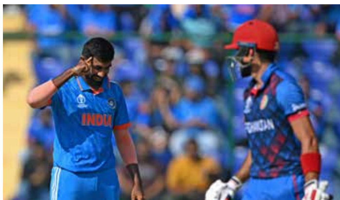
India's Jasprit Bumrah celebrates after taking the wicket of Afghanistan's Ibrahim Zadran