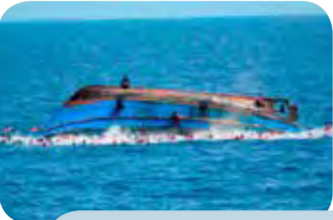
At least 28 dead in DR Congo shipwreck