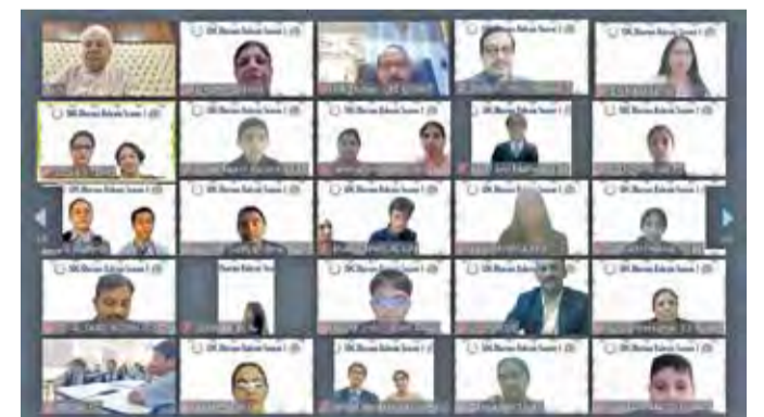
participants during the discussion