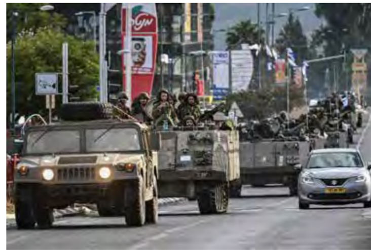
Israeli soldiers patrol in armoured personnel carriers at an undisclosed position in northern Israel near the border with Lebanon

"(Israel) should listen earnestly to the calls of the international community and the UN secretary general, and cease its collective punishment of the people of Gaza," Wang added in a change from Beijing's earlier ambiguous statements on the conflict. Yesterday, speaking on CBS, White House National Security