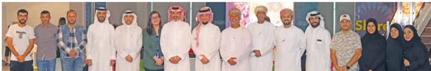
Participants during a photocall