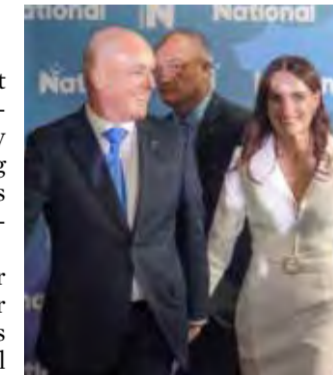
New Zealand's National Party leader Christopher Luxon celebrates victory with his supporters

Christopher Luxon said it was a "tremendous privilege" to wake up Sunday as New Zealand's incoming prime minister as he eyed talks to form a new coalition government. Voters ended the six-year reign of the centre-left Labour government on Saturday as Luxon's conservative National Party won enough seats to govern in a coalition with liberal party ACT.