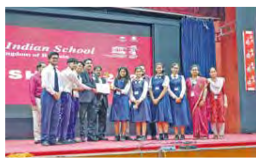
In pictures, English Day celebrations at ISB