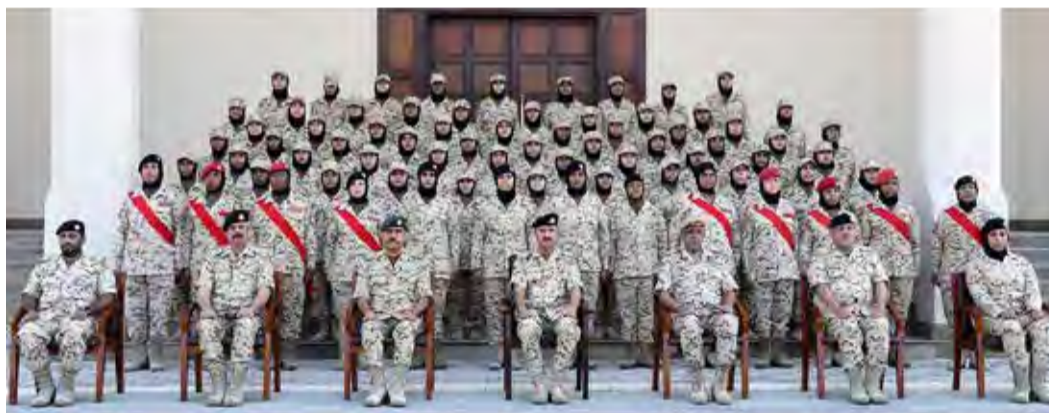
Female civilian volunteers taking part in the event

A number of female volunteers from the civilian sector in the female reserve force who are relatives of employees and retirees in the BDF and the National Guard (military and civilian) participate in this course. This course aims to give them