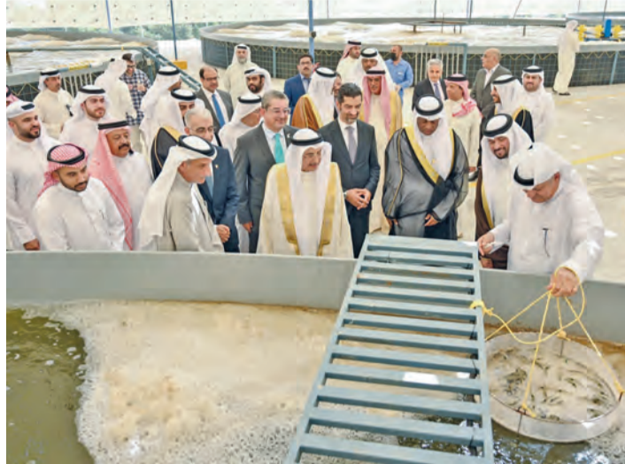
The Deputy Prime Minister with senior government officials at the event

The deputy premier indicated that based on its 2023-2026 programme, the government will support projects aimed at achieving food security, through offering a package of investment plots