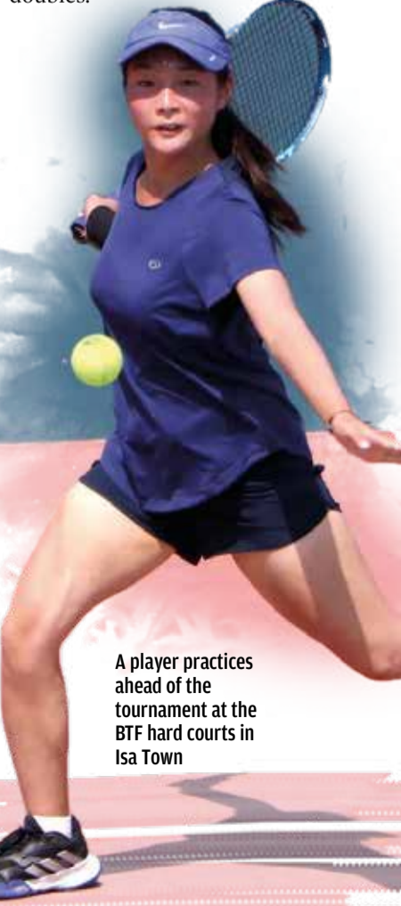
A player practices ahead of the tournament at the BTF hard courts in Isa Town

Meanwhile, all three junior events are part of the ITF World Tennis Tour Juniors, featuring the world's top tennis talents aged 13 to 18. Each event in the Kingdom will feature play in boys' and girls' singles and doubles.