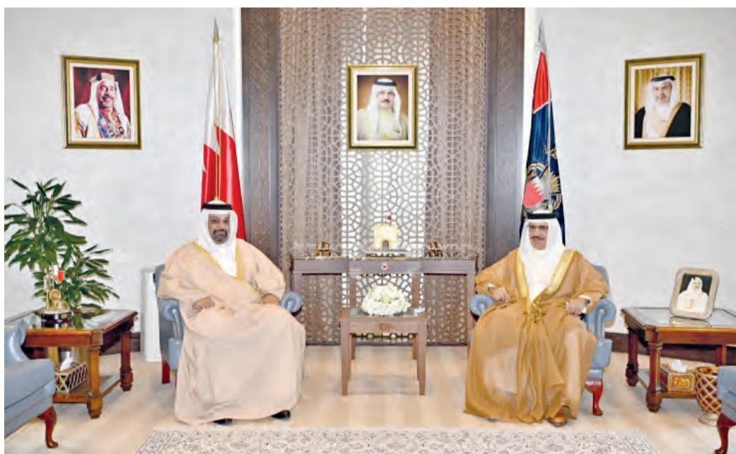
General Shaikh Rashid bin Abdullah Al Khalifa, Interior Minister, received Shaikh Salman bin Khalifa Al Khalifa, Minister of Finance and National Economy. The two sides discussed cooperation and coordination to provide services to citizens and residents at the highest standards.