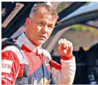
Sebastien Loeb - Bahrain Raid Xtreme Prodrive Hunter

Runner up in Morocco last year after a splendid drive in his BRX Prodrive Hunter, Orly Terranova was