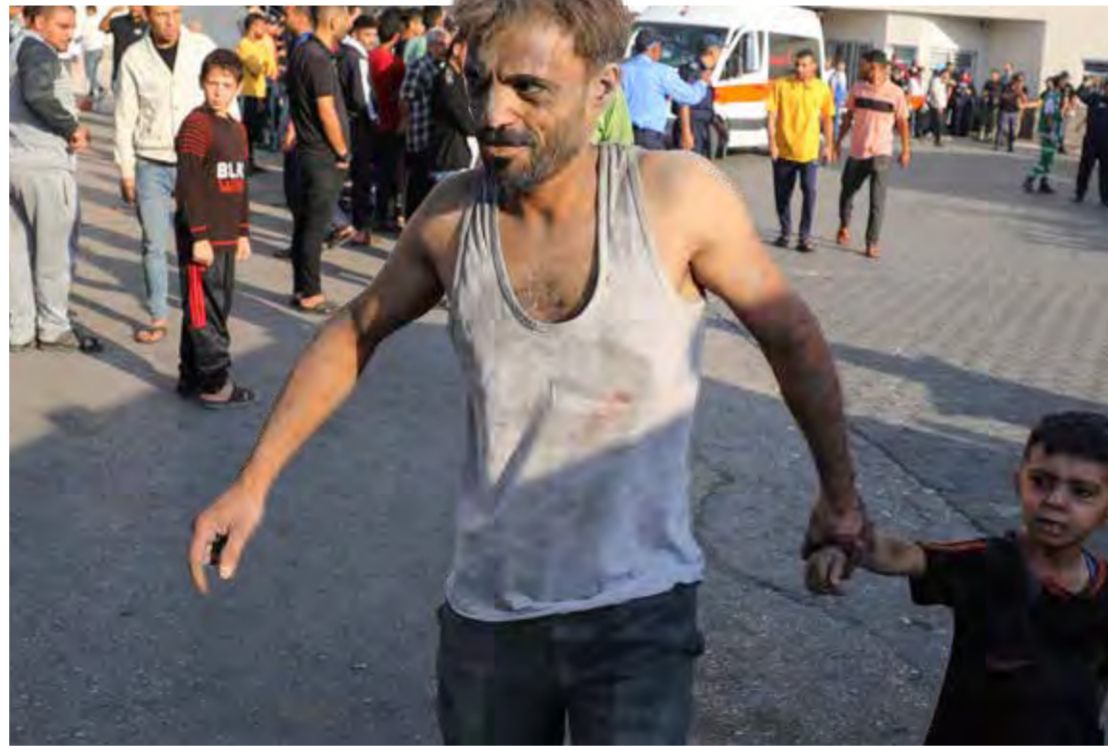
An injured Palestinian man and boy arrive to Al-Shifa hospital in Gaza City following Israeli bombardment

"This historical injustice should end as soon as possible," Wang said, adding that "China will continue to stand on the side of peace and support the just cause of the Palestinian people in safeguarding their national rights."