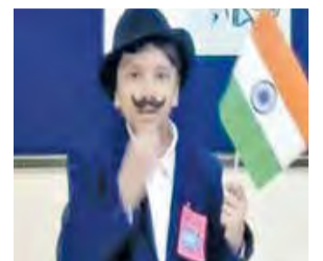
Students performing during the competition