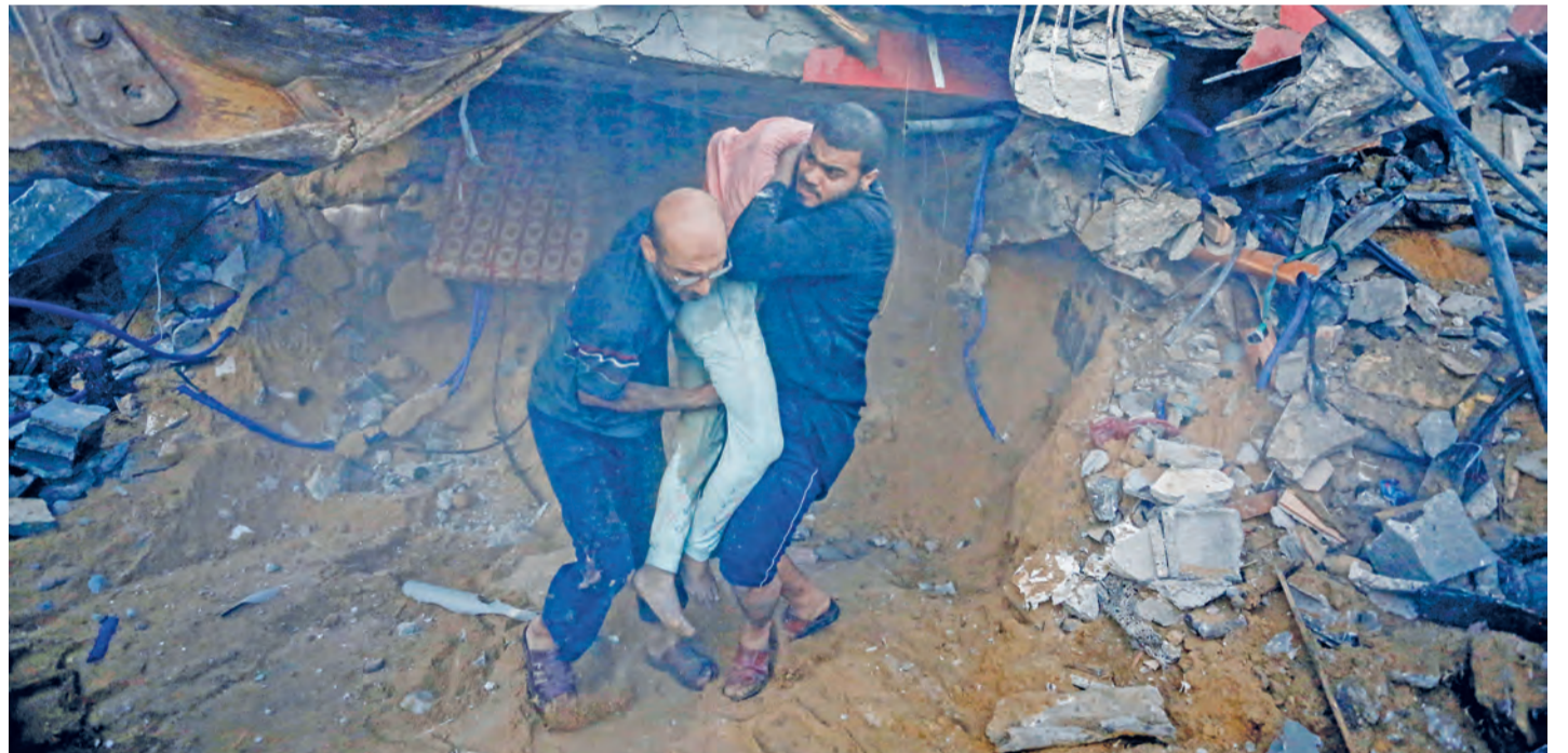
Palestinian rescuers lift the body of a young person from under the rubble of a home following an Israeli attack on the town of Deir Al-Balah, in the central Gaza Strip, yesterday.

der area with its northern neighbour Lebanon to civilians, with its defence minister saying it had no interest in a war in the north and doesn't want to escalate the situation.