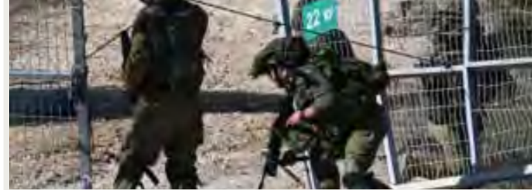
Israeli soldiers patrol in armoured personnel carriers at an undisclosed position in northern Israel near the border with Lebanon