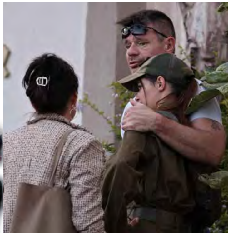
An Israeli soldier hugs her parents before returning to military service at the army base in Ramla