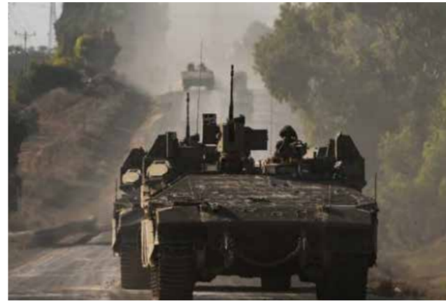
An Israeli armoured vehicle rolls in a field close to the border with the Gaza

"In fact, Gaza is being strangled and it seems the war right now has lost its hu-