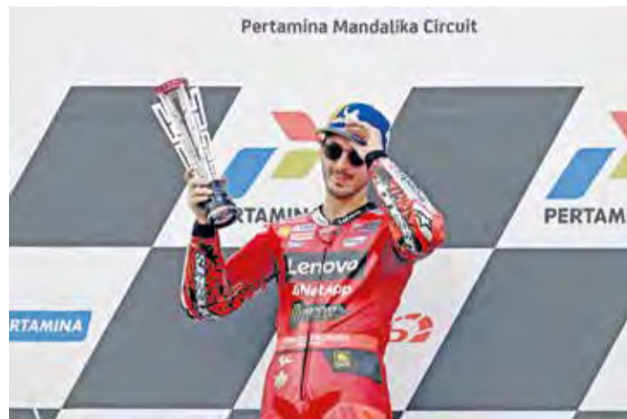
First-placed Ducati Lenovo Team's Italian rider Francesco Bagnaia celebrates with the winner's trophy

double weekend for Martin after winning Saturday's sprint and taking the lead from the green light, up from sixth, to dominate the early stages of the race.