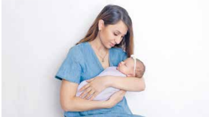
The World Breastfeeding Week is regularly observed in the Kingdom from August 1 to 7

"Seventy-one percent of the countries had updated their indicators since 2015, and 16 per cent have collected breastfeed-