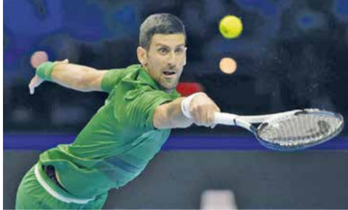
Serbia's Novak Djokovic returns the ball to Greece's Stefanos Tsitsipas

Djokovic's three-year ban can be overturned at the discretion of Prime Minister Anthony Albanese's centre-left govern-