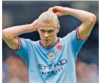
Erling Haaland reacts during a match

"What I will train on? Nothing special I think, it's been going quite well my first months