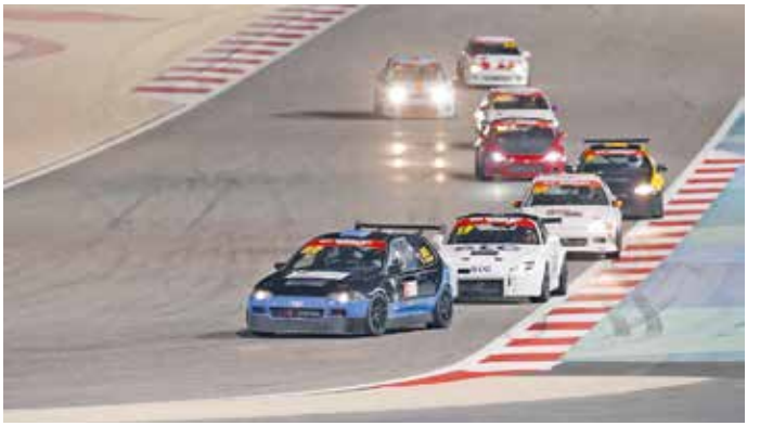
Action from a previous BIC 2,000cc Challenge

The opening meeting will be taking place during the daytime with practice kicking the pro-