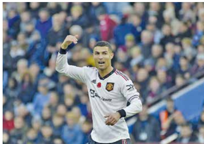
Manchester United's Cristiano Ronaldo gestures during a match (file photo)

However, the 37-year-old was absent from the squad in Sun-