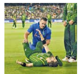
Pakistan's Shaheen Shah Afridi (C) lies on the ground as he receives treatment after an injury