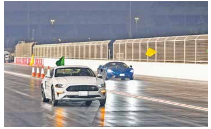
Cars in action at BIC (file photo)