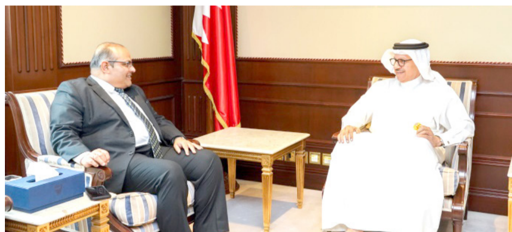
Foreign Minister Dr Abdellatif bin Rashid Al Zayani received Indian Ambassador to Bahrain Piyush Srivastava. The meeting discussed strong historical ties binding the two friendly countries, which are based on mutual respect. They reviewed ways of bolstering bilateral relations and cooperation and discussed topics of common interest.