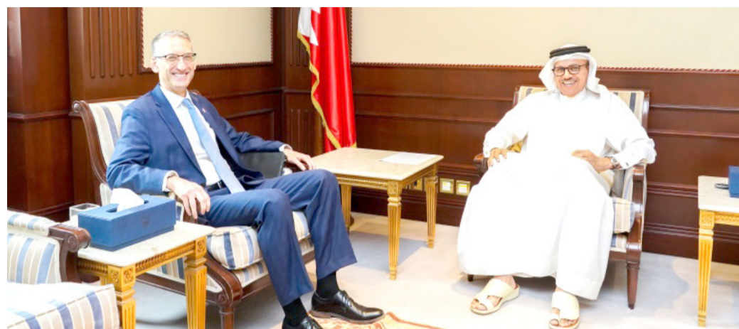
Foreign Minister Dr Abdellatif bin Rashid Al Zayani received yesterday the US Ambassador to the Kingdom of Bahrain, Steven C. Bondy. They discussed cooperation within the framework of historical and strategic ties binding the two friendly countries. They also reviewed ways of bolstering bilateral relations to serve common interests and discussed regional issues of common concern.