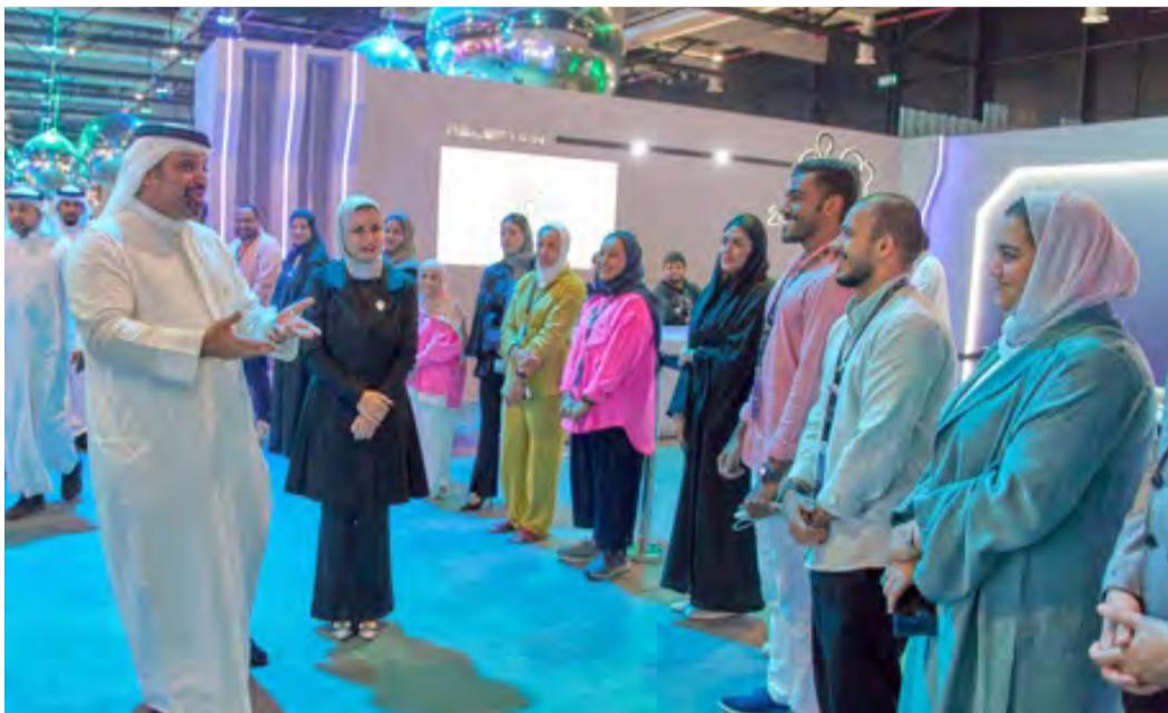
H.E. Shaikh Salman bin Khalifa Al Khalifa and H.E. Rawan bint Najeeb Tawfiqi at the event

H.E. Rawan bint Najeeb Tawfiqi, Minister of Youth Affairs, gave an overview of the various training courses within Youth City 2030. The ministers were