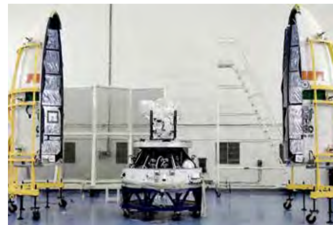
File photo of the satellite placed into orbit by ISRO's SSLV-D3 rocket on Friday.