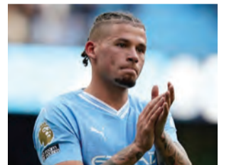
Calvin Phillips

Premier League new boys Ipswich signed Manchester City midfielder Calvin Phillips on a season-long loan yesterday.