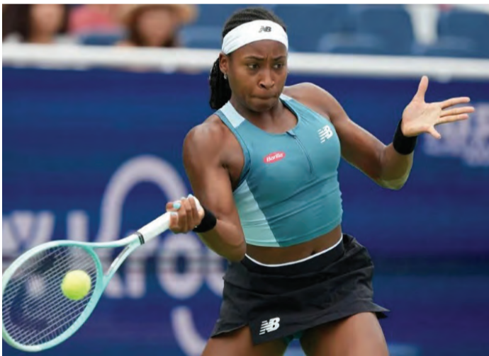
Coco Gauff in action

Gauff was eliminated earlier in a 6-4, 2-6, 6-4 upset loss to Kazakh spoiler Yulia Putintseva.