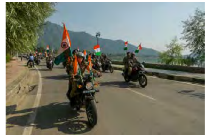
Indian paramilitary troopers take part in a motorbike rally during 'Har Ghar Tiranga' campaign ahead of the country's independence day, around the Dal lake in Srinagar