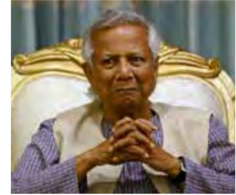
Nobel laureate and Chief adviser of Bangladesh's new interim government Muhammad Yunus

Indian Prime Minister Narendra Modi offered yesterday support to the interim leader of neighbouring Bangladesh, who took power after Sheikh Hasina was ousted.