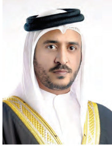
HH Shaikh Khalid bin Hamad Al Khalifa

Over 15 sports federations are expected to participate in the Khalid bin Hamad Gold Generation Athletics League, with approximately 1,000 male and female athletes under the age of 18.