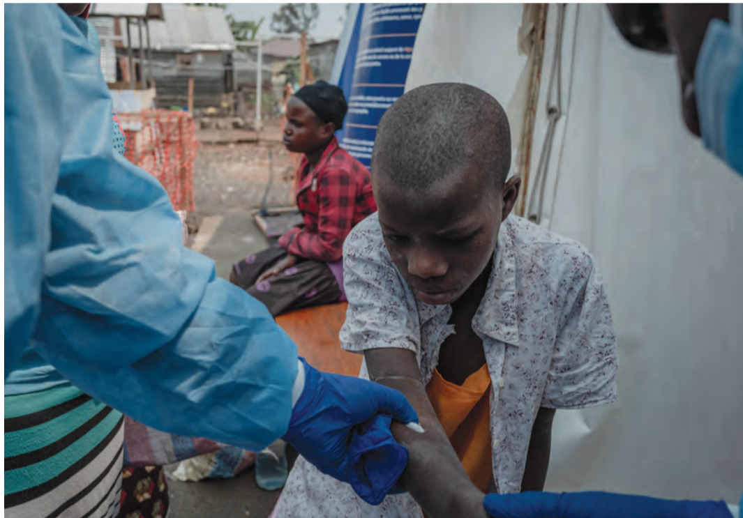
Doctors take samples from a patient at the Mpox treatment centre in Nyiragongo general referral hospital, north of Goma in the Democratic Republic of Congo.

monkeypox, has two subtypes: Clade 1, endemic in the Congo Basin in central Africa; and