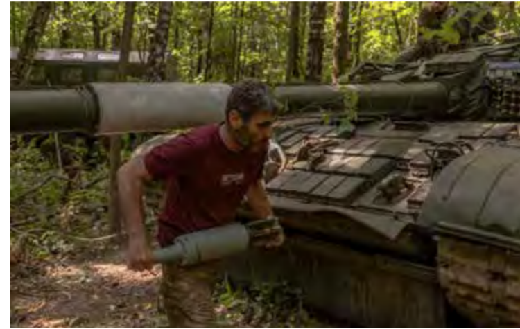
A Ukrainian serviceman unloads shells from a Soviet-made T-72 tank, in the Sumy region, near the border with Russia

Ukraine said yesterday its incursion into Russian territory was aimed at forcing Russia to negotiate on "fair" terms, as Moscow's troops announced new gains in eastern Ukraine.