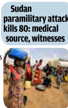
Sudanese paramilitary attack kills 80: medical source, witnesses

Sudanese paramilitary forces killed at least 80 people in an attack on a village in the war-torn country's southeast... Sudanese paramilitary attack kills 80: medical source, witnesses