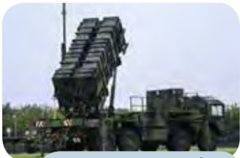
US approves $5 bn Patriot missile sale to Germany

The United States on Thursday announced its approval of a $5 billion sale of up to 600 Patriot missiles and related equipment to Germany... US approves $5 bn Patriot missile sale to Germany