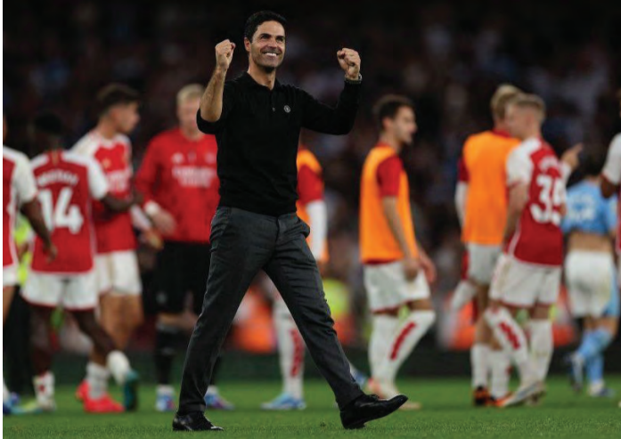
Arsenal's Spanish manager Mikel Arteta celebrates their victory on the pitch

Mikel Arteta reportedly hired a group of pickpockets to teach his Arsenal stars a valuable lesson and is now planning to steal the Premier League title from Manchester City.