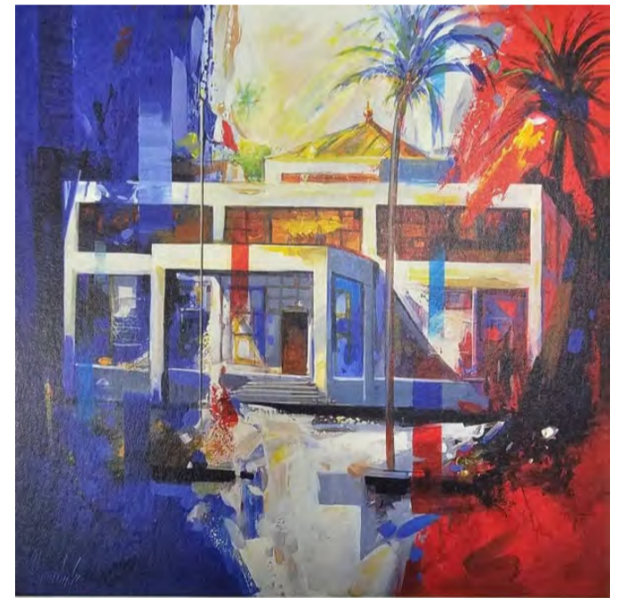
AMBASSADE DE FRANCE À BAHRÉINE Liberté, Égalité, Fraternité