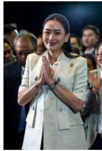
Thailand's new Prime Minister Paetongtarn Shinawatra, known by her nickname "Ung Ing" and daughter of former prime minister Thaksin Shinawatra, gestures during a press conference in Bangkok

The 37-year-old daughter of billionaire Thaksin Shinawatra became Thailand's prime minister yesterday, the third member of the influential but divisive clan to lead the country.