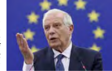
The EU's top diplomat Josep Borrell

The EU's top diplomat Josep Borrell said yesterday he would propose sanctions against Israeli government "enablers" of Jewish settler violence, following a deadly attack on a village in the occupied West Bank.