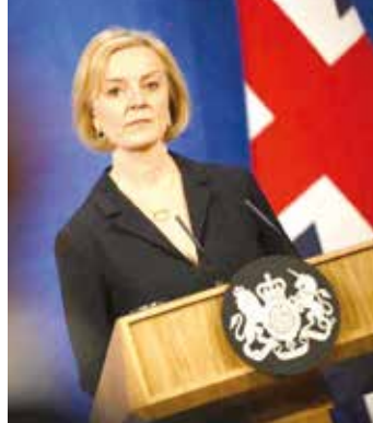
UK Prime Minister Truss

yway, I just think – I disagreed He added: "I think that the with the policy, but that's up to the economic theory at the heart erned and the choices being