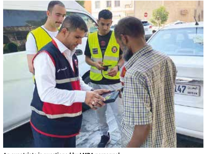
It reflects the ongoing efforts An expatriate is questioned by LMRA personnel

The campaign resulted in detecting several violations related to LMRA's Law and Immigration authority and the arrest of violators. Necessary legal action was taken and deportation proce-