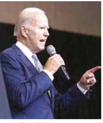
US President Biden

"I think that the idea of cutting taxes on the super wealthy at a time when anyway, I just think – I disagreed with the policy, but that's up to Great Britain to make that judgment, not me."