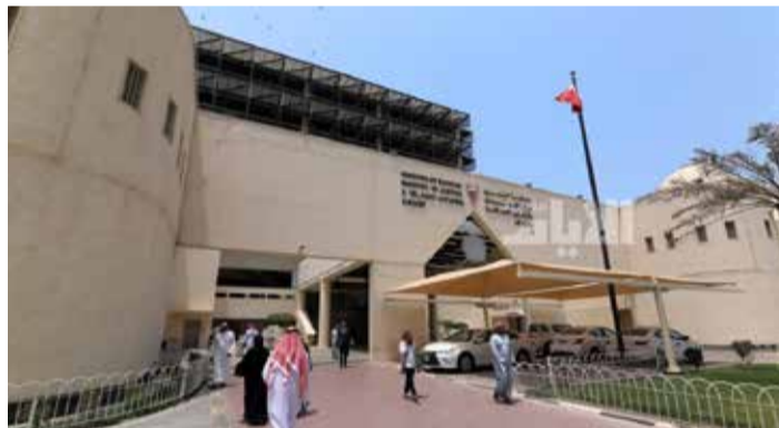
The headquarters of the Justice, Islamic Affairs and Endowments Ministry