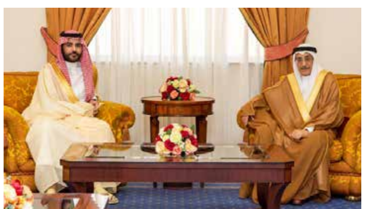
The Deputy Prime Minister with the Saudi Ambassador

The Deputy Prime Minister highlighted efforts to deepen Khalifa, the Crown Prince and made the statements while reintegration between the two Prime Minister, and those of His ceiving at the Gudaibiya Palace brotherly countries in various Royal Highness Prince Moham- yesterday the Saudi Ambassador