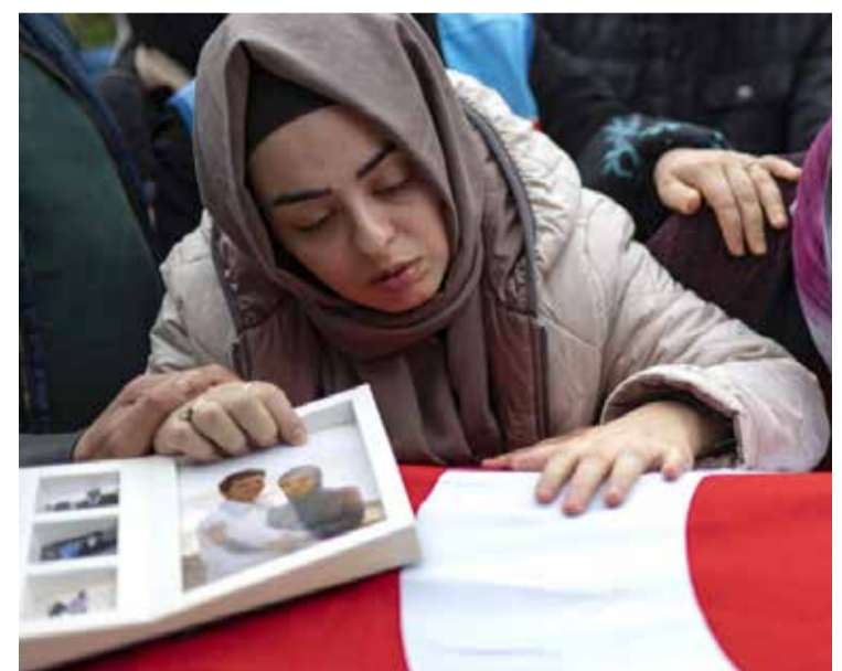
Funeral services were held in the village of Ahatlar on Sunday

A relative hung flags outside the house. Shoes piled up on the doormat, and women covering their heads with scarves packed into