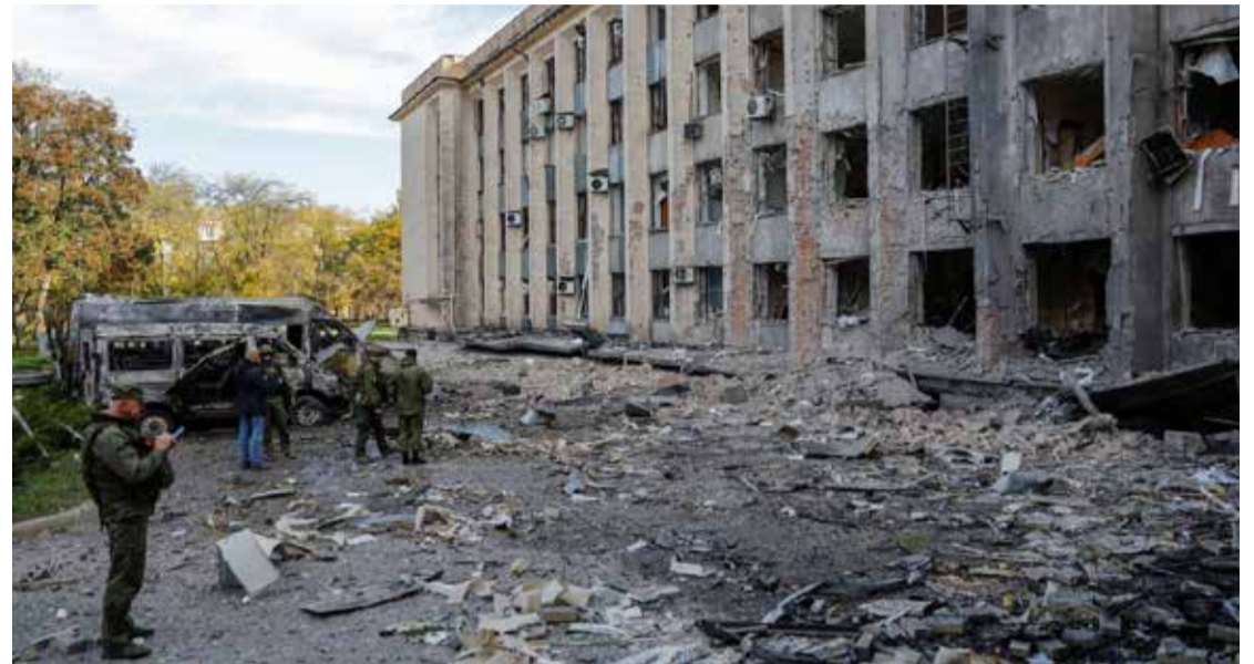
A view shows the city administration building hit by recent shelling in the course of Ukraine-Russia conflict in Donetsk, Russian-controlled Ukraine

Russia has opened a criminal investigation after gunmen shot dead 11 people at a military training ground near the Ukrainian border, authorities said yesterday, as fighting raged in eastern and southern Ukraine.