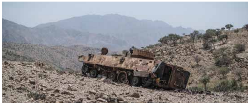
The conflict in the Tigray region erupted in November 2020

Prime Minister Abiy Ahmed's government, and the Tigrayan authorities, have accepted an AU invitation to talk, but nego-