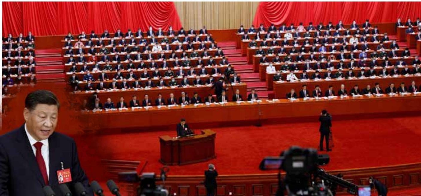
Chinese President Xi Jinping speaks during the opening ceremony of the 20th National Congress of the Communist Party of China, at the Great Hall of the People in Beijing, China

Shelling by Ukrainian forces damaged the administration building in the city Donetsk, capital of the Donetsk region, the head of its Russian-backed administration said yesterday.