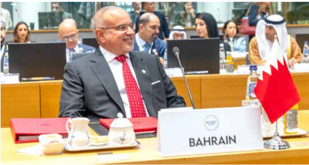
HRH Prince Salman with European leaders at the event

Both the GCC and the EU were founded on principles of cooperation, with a shared vision of fostering security, economic prosperity and regional unity. In this spirit, we must also ensure that our efforts lead to stronger and deeper partnerships of like-minded countries around the world.