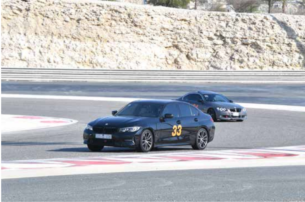
Cars in action at BIC

Tomorrow's events will be held along BIC's 2.55-kilometre Inner Track. Action is scheduled to get underway at 1.15pm and continue until 9.30pm, making for varying conditions for both competitors and fans with thrilling day-to-night racing. The podium ceremonies are scheduled