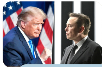
Musk donates almost $75 million to Trump's presidential cause

◆ US authorities have hit Lufthansa with a record $4 million penalty after finding the airline discriminated against more than 100 Jewish travelers by blocking them from boarding a flight in 2022, officials said Tuesday. The 128 passengers were denied boarding to a connecting flight after a few did not follow instructions, including Covid mask requirements, on a flight from the United States to Germany, US Transport authorities said. The US Department of Transportation said the penalty over the boarding refusal on May 3, 2022 in Frankfurt was the largest it had issued for a civil rights violation. The travelers - who wore distinctive garments including black hats and jackets - told investigators they were treated as if they were one group, even though many were not flying together and did not know each other.