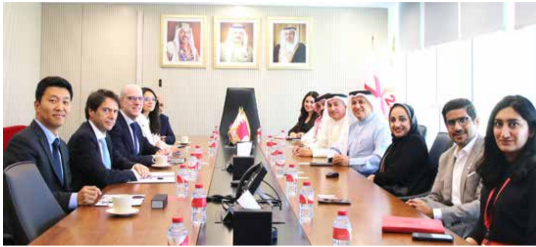
BENEFIT and IMF officials during a meeting

The IMF's Article IV consultations are conducted in all 190 member countries of the International Monetary Fund. These consultations provide recommendations on a broad range of economic challenges, including fiscal, monetary, and exchange rate policy, as well as health-