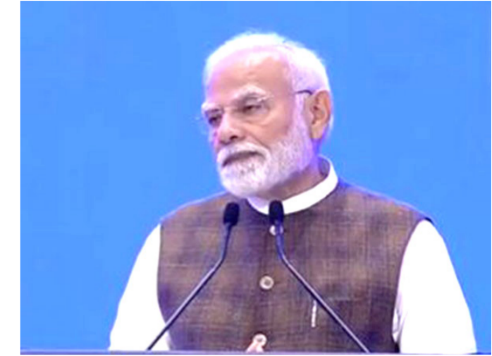
Modi TDT | agencies

While inaugurating the India Mobile Congress 2024 on Tuesday, Prime Minister Narendra Modi called for global standards for artificial intelligence (AI) and data privacy.