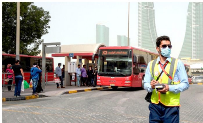
Bahrain's public transport bus

Statistics show that over one million trips were operated in March 2024, contributing to a total of approximately 92.22