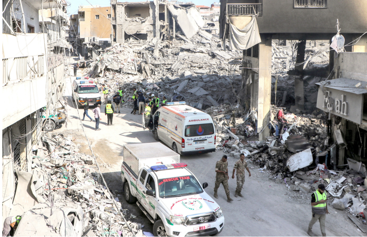
Civil defence rescue vehicles arrive at the site of an overnight Israeli air strike on the village of Qana in southern Lebanon

Pointing to the "dire" humanitarian situation in Gaza, Starmer also called for Israel to "take all possible steps to avoid civilian casualties, to allow aid into Gaza in much greater volume".