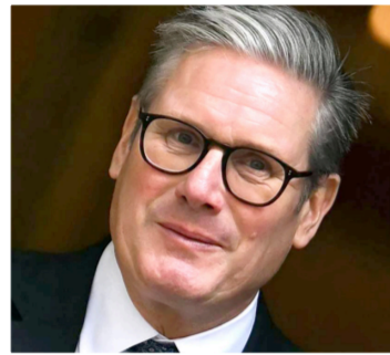
British Prime Minister Keir Starmer AFP | London, United Kingdom

British Prime Minister Keir Starmer said on Wednesday the government was weighing up sanctions against far-right Israeli ministers Itamar Ben Gvir and Bezalel Smotrich. Asked in parliament if the government would sanction the pair, Starmer said: "We are looking at that because there are obviously abhorrent comments along with other really concerning activity in the West Bank."