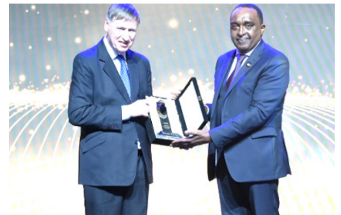
The award ceremony