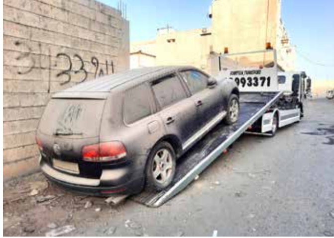
A major cleanup operation in Northern Governorate TDT | Manama

Rusted cars left abandoned across the Northern Governorate have finally been cleared, as authorities hauled away 161 vehicles in a focused operation.