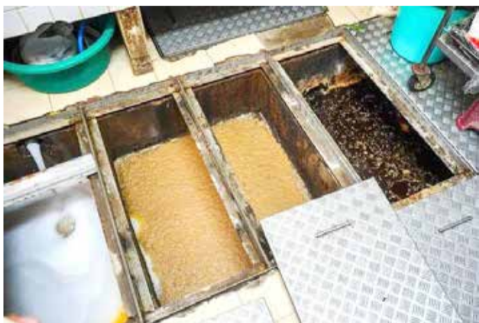
A grease trap captures kitchen waste and oils, preventing drain blockages and pollution

For food businesses, installing these traps is essential to maintain hygiene standards and