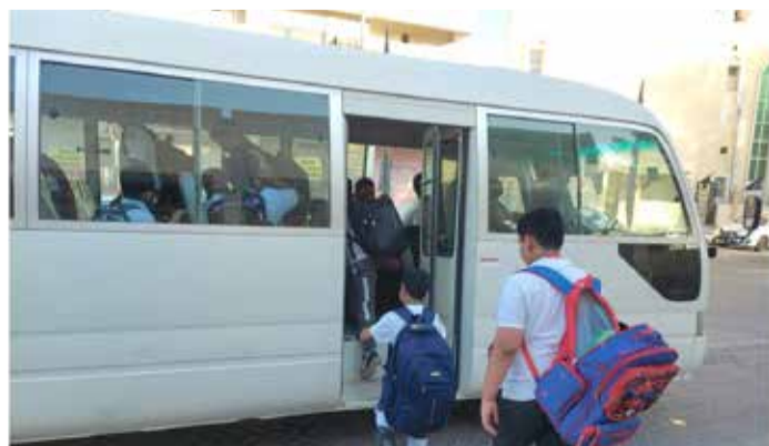
Ensuring safe travel for students

The General Directorate of Traffic previously had called earlier for verification of driver