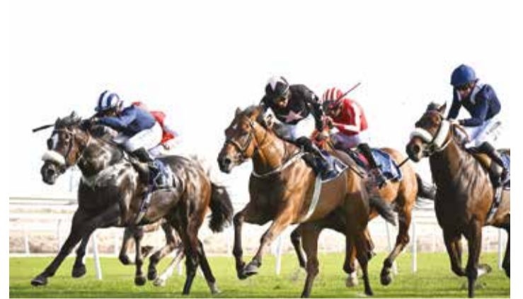
Action from the meeting

In the day's fifth race, Bond's Boy won the Al Hawaj Cup over 10 furlongs to take the lion's share of the BD3,000 prize. The