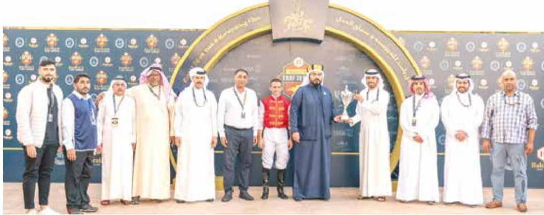
Winners from yesterday's races