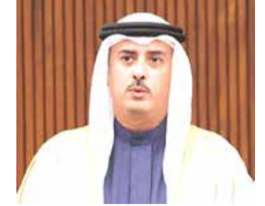
Minister Nawaf Al Maawda

ital shift, the ministry has also set up a dedicated register to capture the email addresses and phone numbers of individuals and entities involved in legal proceedings. These contact details are either provided by the