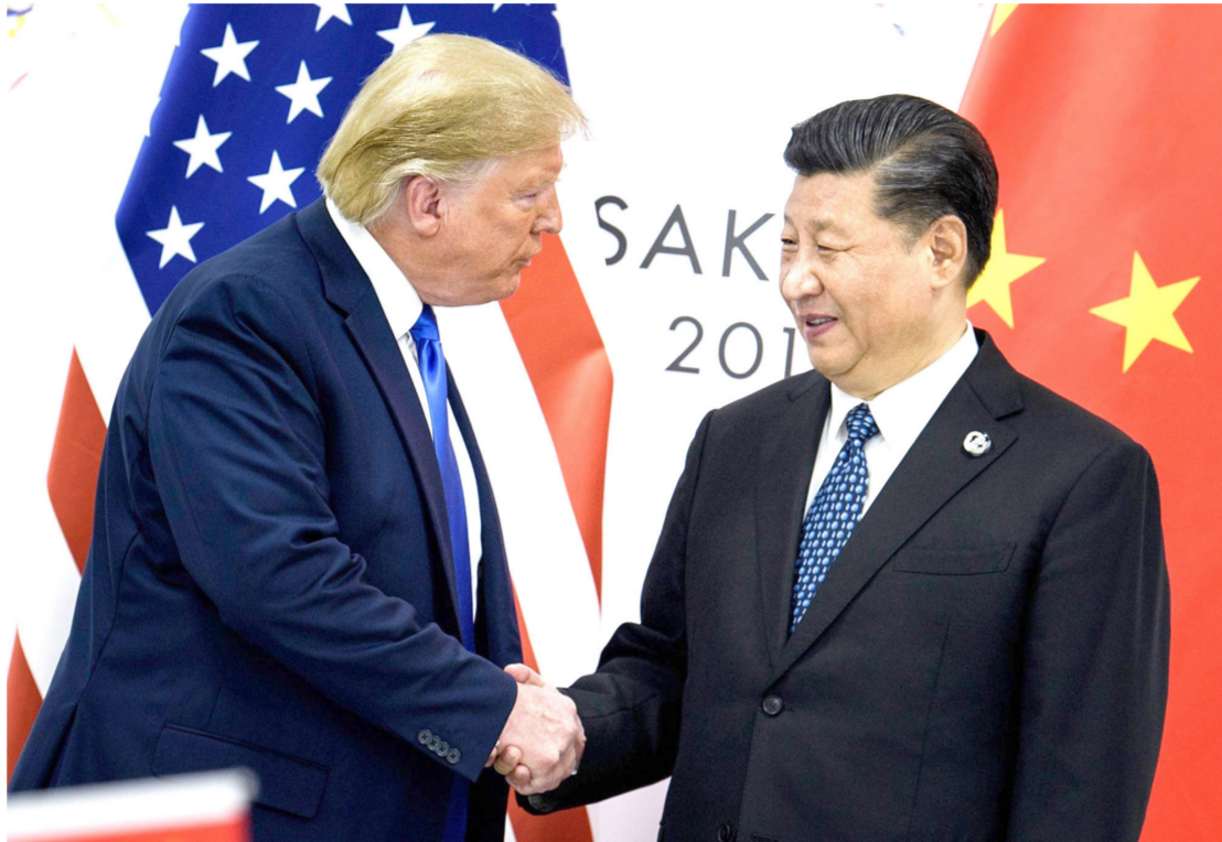
China's President Xi Jinping (R) shakes hands with US President Donald Trump during G20 Summit in Osaka in 2019 (file photo)

Donald Trump and Chinese President Xi Jinping spoke by phone yesterday, days before the incoming US president returns to the White House, with both leaders vowing to take a positive approach to improving ties between the rival countries. Xi said he hoped for a "good start" to relations with Trump, who in turn said "it is my expectation that we will solve many problems together, and starting immediately."