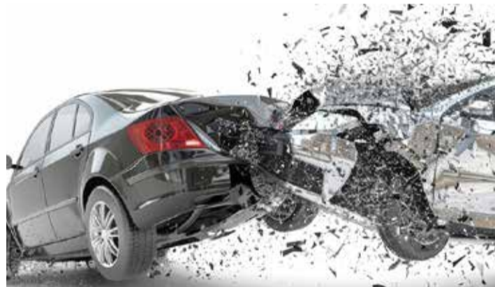
Representative picture

ported to the hospital but, unfortunately, succumbed to her injuries shortly after arriving. Details regarding the num-