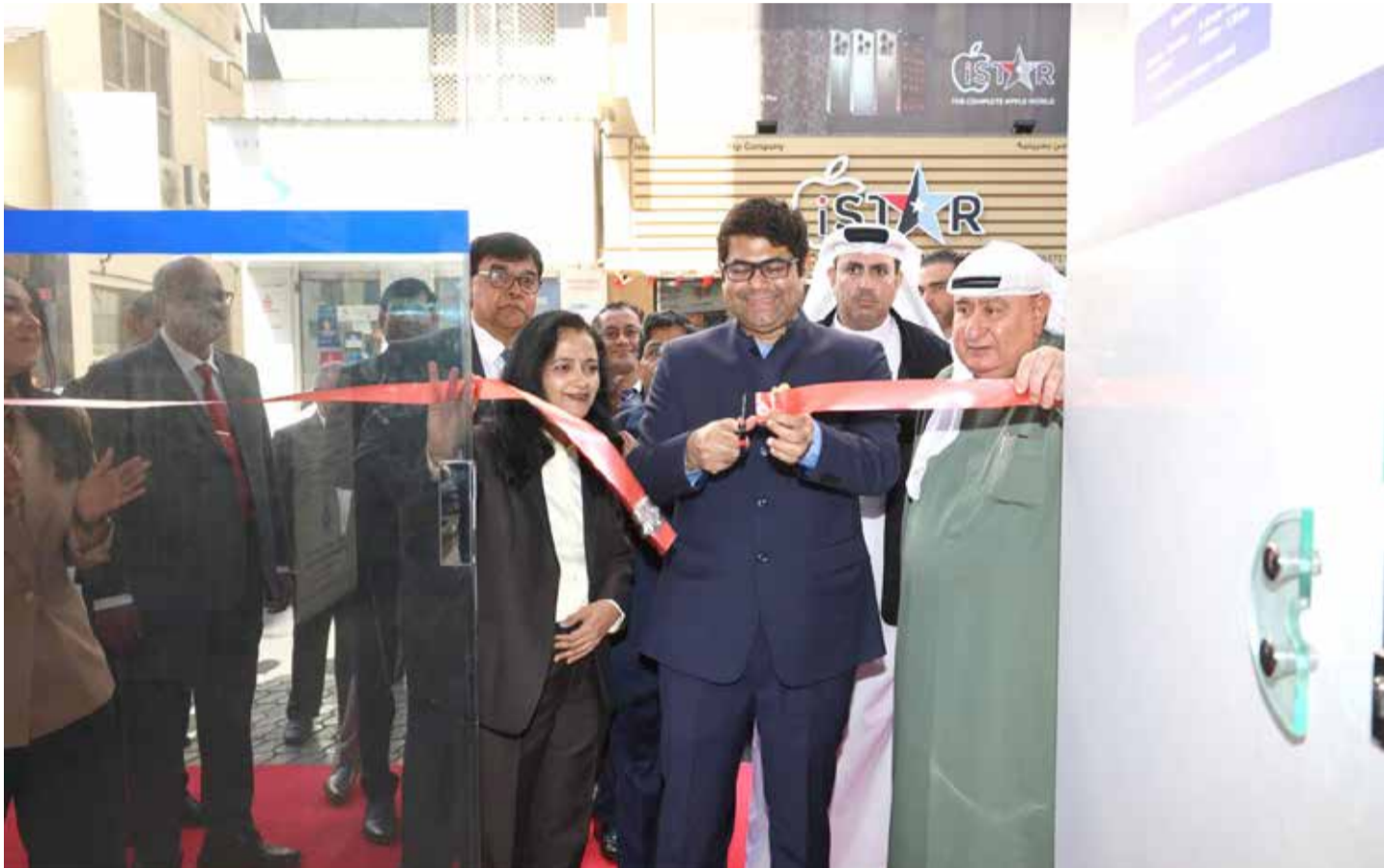
The branch opening ceremony

The New Claims office is fully digital-enabled and will ensure faster turnaround time of all motor claims settlement from accident to final settlement. The claim process is fully automated, linking the accident affected claimant to Vehicle towing, 24X7 Roadside Assistance, Car