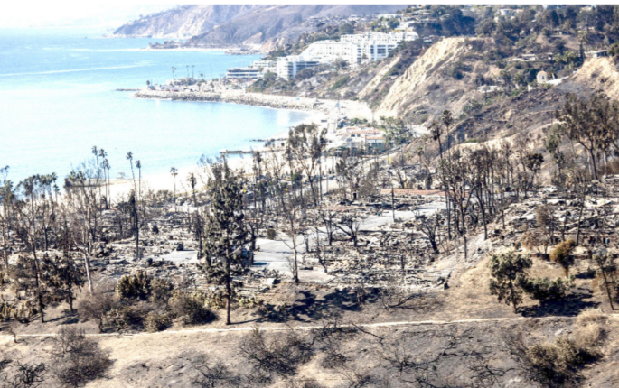
An entire area ravaged by the Palisades Fire is seen in the Pacific Palisades neighborhood of Los Angeles