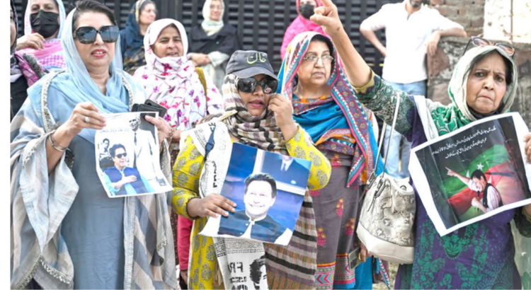
Supporters shout slogans as Busrha Bibi the wife of Pakistan's former prime minister Imran Khan, arrives at Bani Gala in Islamabad (file photo)

Pakistan court yesterday convicted former Pakistan prime minister Imran Khan and his wife Busrha Bibi in a landmark graft case, sentencing Khan to 14 years in prison. Khan has been held in custody since August 2023 charged with around 200 cases but his party claim the latest conviction was being used to pressure him into stepping back from politics. "I will neither make any deal nor seek any relief," Khan told reporters inside the court room after his conviction.