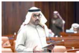
Ahmed Al Salloom, MP