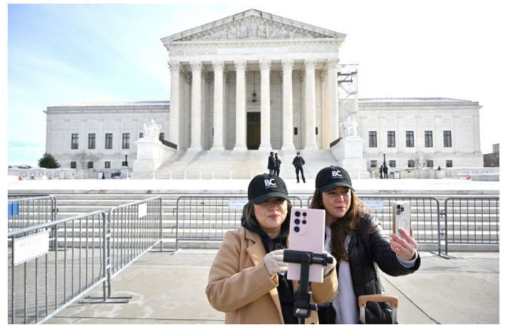
Supporters of Tiktok livestream in front of the US Supreme Court in Washington

With that decision, Sunday's ban effectively stands even if lawmakers and officials across the political spectrum were