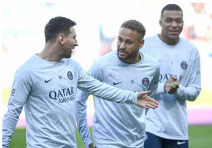
Paris Saint-Germain's Lionel Messi (L), Neymar (C) and Kylian Mbappe discuss as they warm up (file photo)