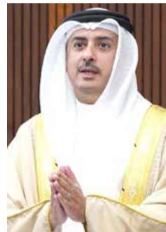
Nawaf Al Maawda, Justice Minister

Specialised courts and facilities, backed by new regulations, ensure effective implementation. The Justice Ministry has