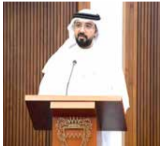
Hassan Ebrahim, MP

The proposed changes to the elderly rights law, set for debate on Sunday, would mandate a 50