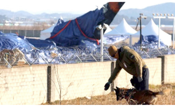
A police officer and his dog search the crash site of the Jeju Air Boeing 737-800 aircraft

It was the worst aviation disaster on South Korean soil. "Feathers were found in both engines," the government-linked National Institute of Biological Resources told South Korean broadcaster MBN, without specifying who gave them the information.