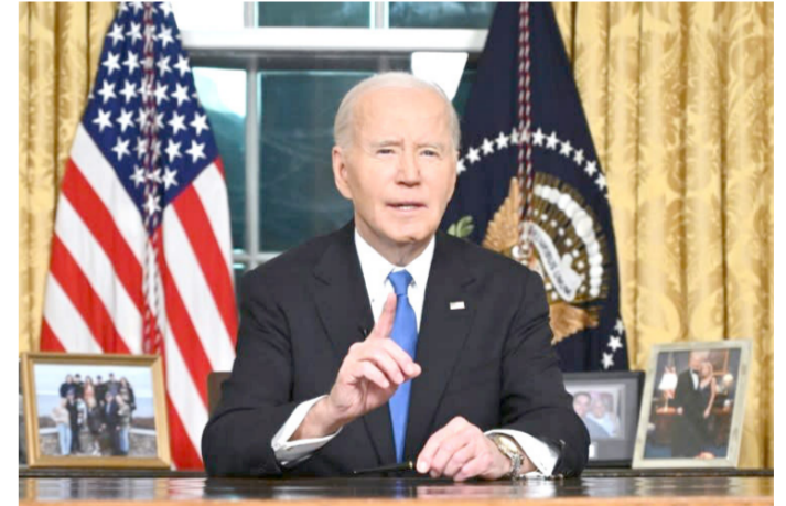
US President Joe Biden delivers his farewell address

early conversations with Netanyahu after the October 7, 2023 attack on Israel by Hamas. "I told them we were going to help, but Bibi, I said, you can't be carpet-bombing in these communities."