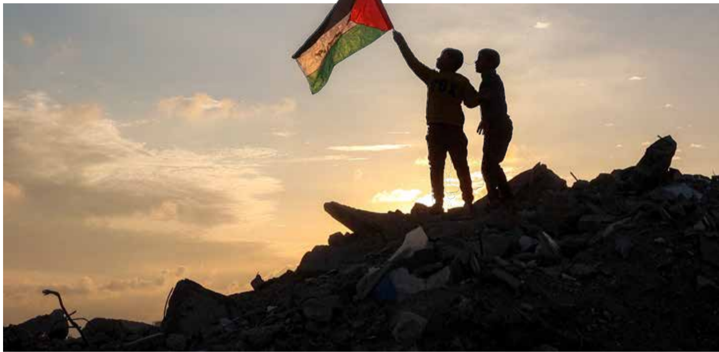
A boy runs with a Palestinian flag atop a mound of rubble at a camp for people displaced by conflict in the central Gaza Strip following the announcement of truce

Israeli security cabinet approves Gaza deal: PM office