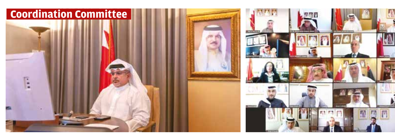
His Royal Highness Prince Salman bin Hamad Al Khalifa, the Crown Prince and Prime Minister, yesterday chaired the 418th meeting of the Coordination Committee remotely. The Coordinating Committee reviewed the developments of the afforestation plan and the latest developments in establishing the American Trade Zone. The meeting also discussed the latest developments in dealing with the Coronavirus (COVID-19) and related procedures.

The Prime Minister shall implement the provisions of this decree, which takes immediate effect, and will be published in the Official Gazette.