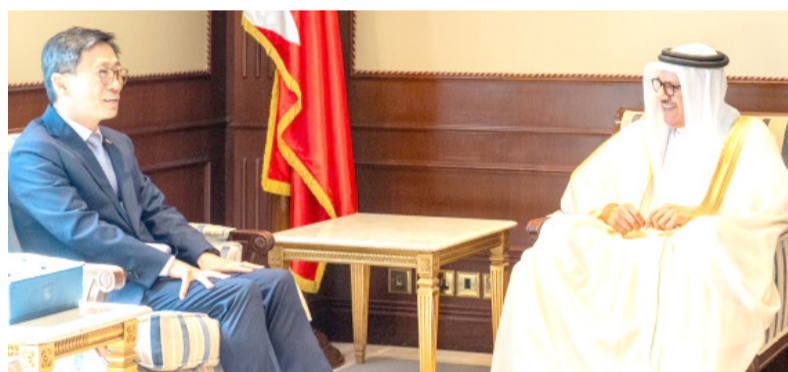
Foreign Affairs Minister, Dr. Abdullatif bin Rashid Al Zayani, received yesterday the South Korean Ambassador to Bahrain, HeonSang Koo. They reviewed the distinguished friendship relations between the two countries, as well as ways to bolster them in various fields to achieve their common interests. They also discussed issues of mutual interest.