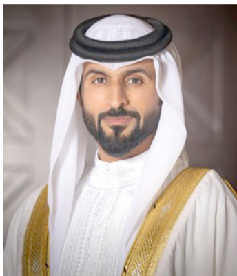
HH Shaikh Nasser

the government, led by His Royal Highness Prince Salman bin Hamad Al Khalifa, the Crown Prince and Prime Minister, which prioritises providing opportunities to enhance the skills of the youth and empower them. HH Shaikh Nasser urged Bahraini youth to benefit from the programmes and training opportunities that are on offer in the upcoming 12th edition of Youth City 2030. The Youth City 2030 project truly reflects the keenness of the SCYS to offer a variety of