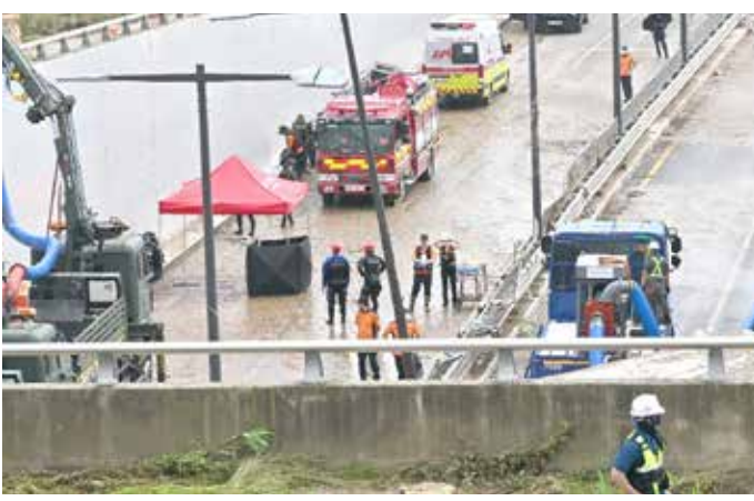
South Korean rescue workers are seen along a road leading to a flooded underpass where about 15 vehicles were trapped after heavy rains

South Korea is at the peak voirs and dams overflowing -- visit to flood-hit North Gyeong- paredness and response.