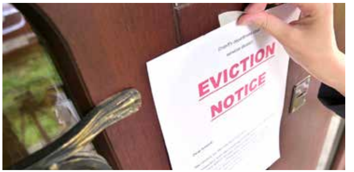
of payment for the renewal of

They also submitted evidence the lease agreement.