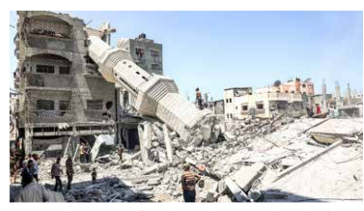
A mosque's minaret collapses following Israeli bombardment in Nuseirat in the

He rammed home the point in central Gaza Strip.