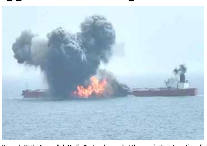
Yemen's Huthi Ansarullah Media Center shows what they say is their targeting of The apparent slick, measuring CHIOS LION, a Liberia-flagged crude oil tanker, by unmanned surface vessels in

220 kilometres (135 miles) long, the Red Sea