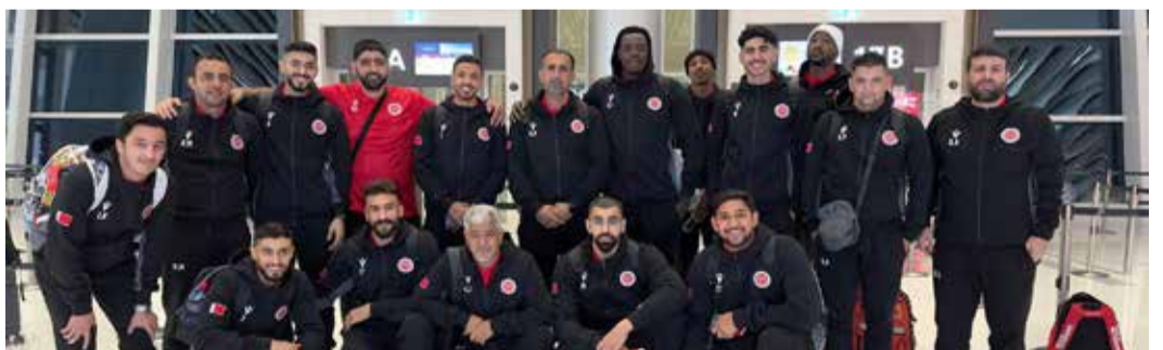
Bahrain's senior men's national basketball team at the airport for their departure

The nationals are scheduled to play two away games in their concluding fixtures in this phase of Asian qualification, first against Australia in Melbourne on February 23 and