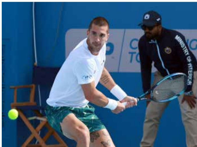
Thanasi Kokkinakis looks to hit a backhand return during his semi-final