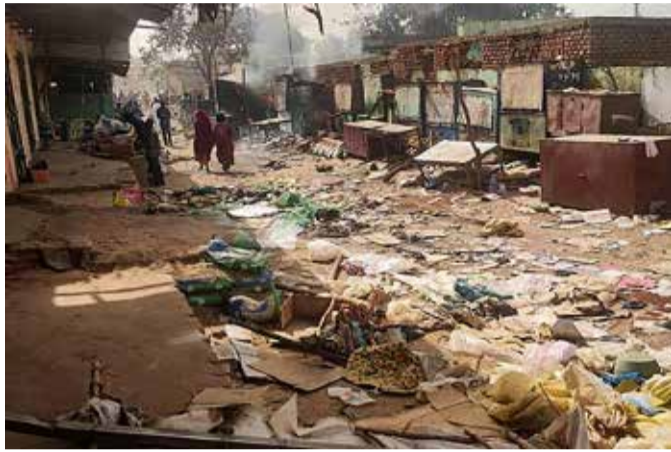
People walk among scattered objects in the market of El Geneina, the capital of West Darfur Khartoum

A 72-hour ceasefire between Sudan's warring generals took effect yesterday to allow for the delivery of desperately needed aid to the country, on the eve of a humanitarian conference.