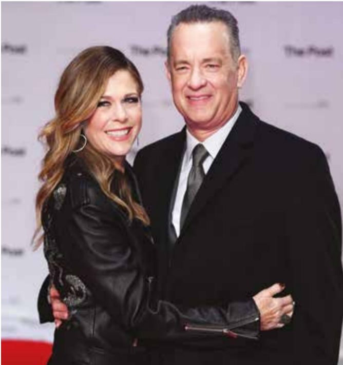
Rita Wilson and Tom Hanks

According to variety, Ronald Regan served as the 40th President of the United States from 1981 to 1989, a Hollywood actor taking on the role of America's Commander in Chief is not unheard of.