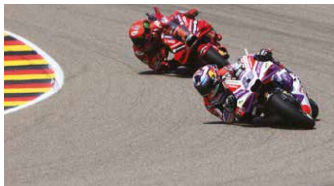
Jorge Martin (R) and Francesco Bagnaia battle it out in the German motorcycle Grand Prix