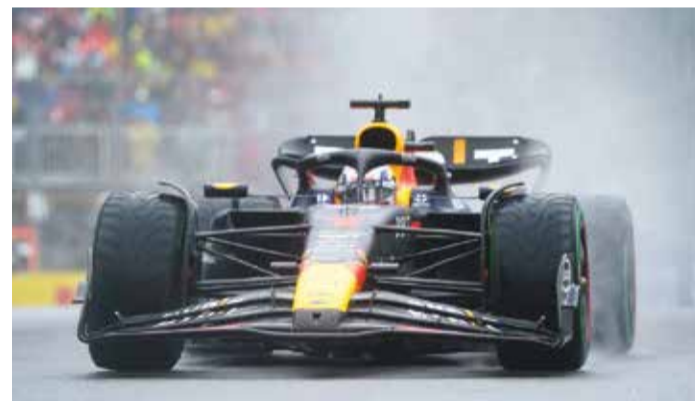
Red Bull Racing's Dutch driver Max Verstappen races during the qualifying session

It also completed a hat-trick for the Dutchman after poles in Monaco and Spain. It will be the third front row starting position for Hulkenberg and the first for the American-owned Haas team. Two-time champion Fernando Alonso was third-fastest for Aston Martin and will share the