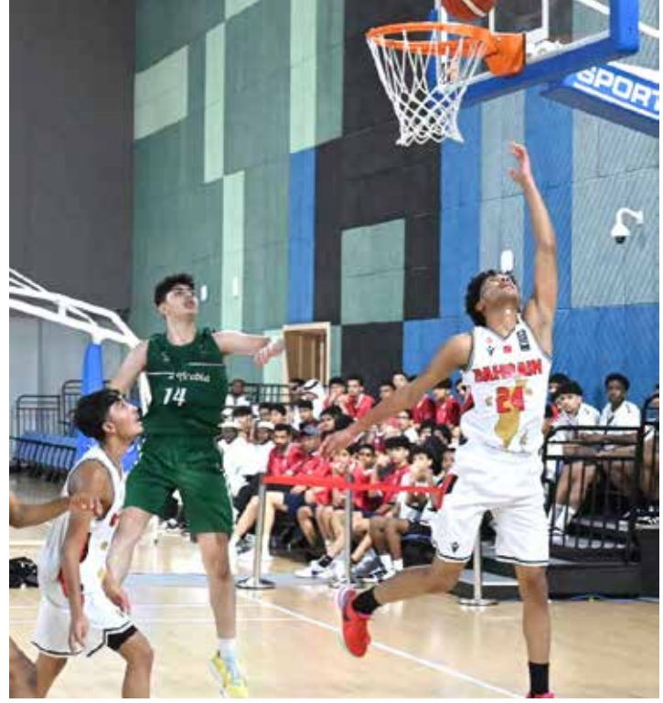
Action from the match

ahrain's U15 basketball national team, nurtured through the Khalid Bin Hamad Golden Generation League, asserted their dominance with an 80-62 victory over Saudi Arabia in the semi-finals of the GCC Under-15 Championship, currently being held in the championship final against regional basketball.