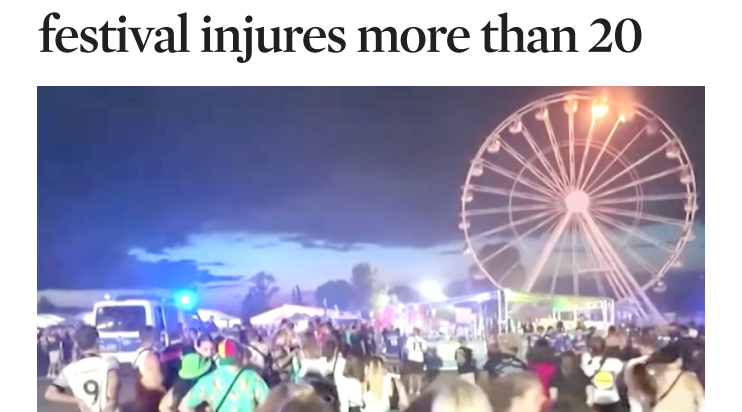
Screen grab from a video posted online shows the Ferris wheel on fire as

panicked revellers look on AFP | Berlin, Germany