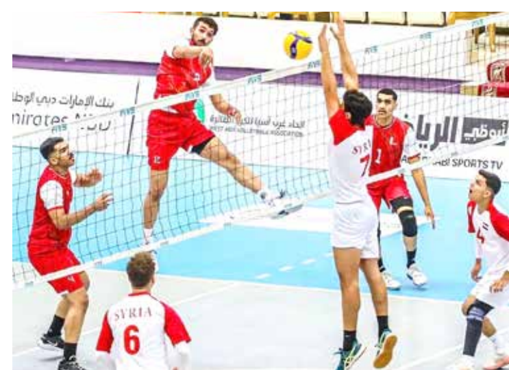
Action from the match

As the championship progresses, Bahrain's junior team embodying the spirit and resil-In the final set, Bahrain's athieuce that define the Kingdom's letes remained relentless, clos- athletic endeavors. With each