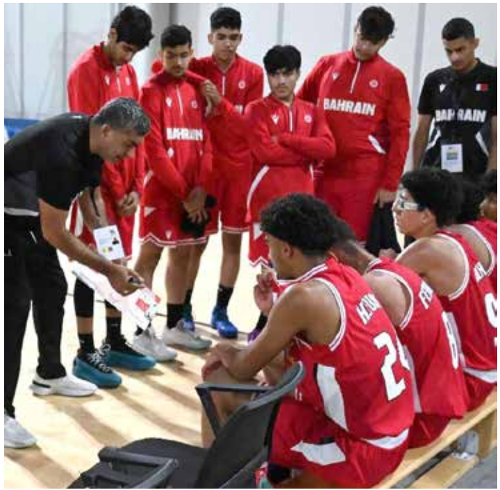
Bahrain's players during a discussion

Bahrain's young stars deliveach player contributing to the