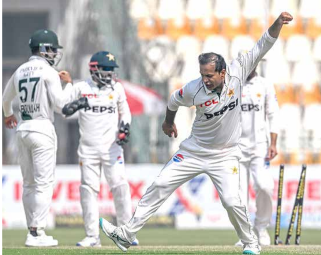
Pakistan's Noman Ali (R) celebrates after the dismissal of England's captain Ben Stokes

The captain, who like his team had been under fierce pressure