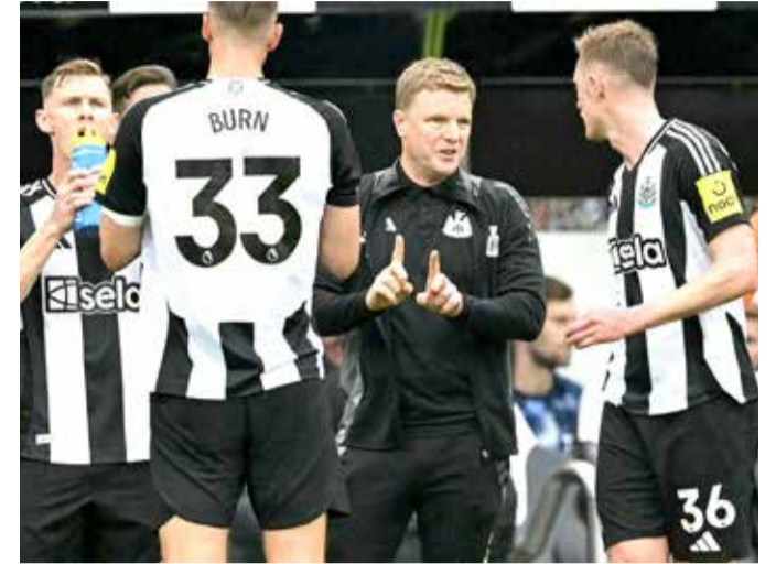
Newcastle United's head coach Eddie Howe speaks with players (file photo)