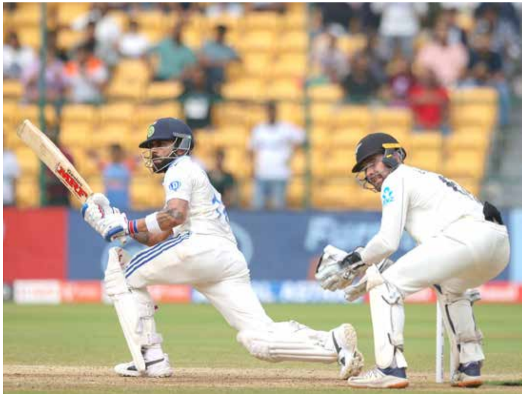
India's Virat Kohli plays a shot

Sarfaraz raced to his fifty in 42 balls but the crowd erupted when senior partner Kohli got his half ton at his adopted home ground of IPL team Royal Challengers Bengaluru.