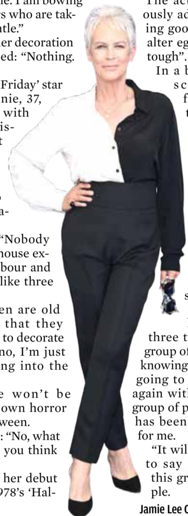
Jamie Lee Curtis

"It will be difficult to say goodbye to this group of people."