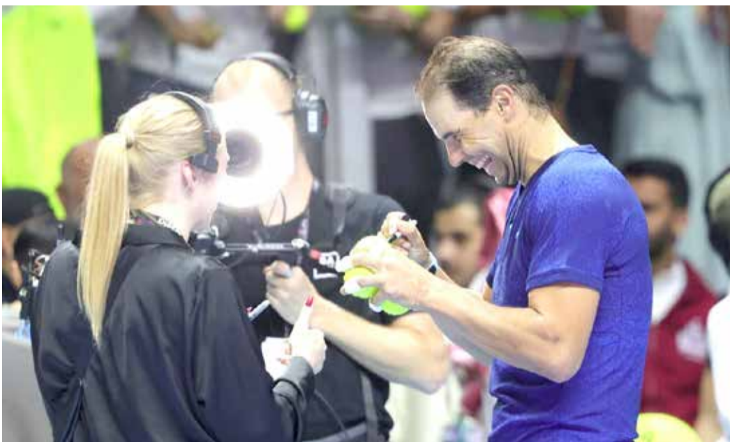
Rafael Nadal signs tennis balls after he was defeated by Carlos Alcaraz

"It's a little bit sad... It was not a really comfortable moment for