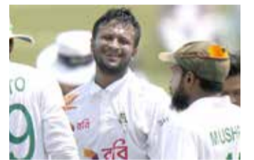
Shakib Al Hasan

But the 37-year-old is also an ex-lawmaker in a government ousted by a revolution, and his links to Bangladesh's autocratic former premier has made him a target of public anger.