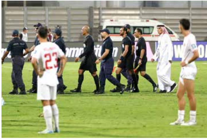
Referee Ahmed Al-Kaf with police after the match

Indonesian officials and supporters later complained bitterly that the added time had gone on for too long.