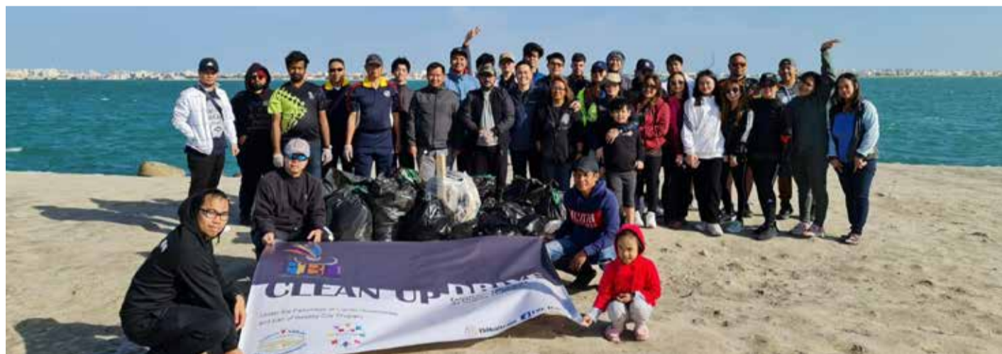
Filipino Badminton League Bahrain members and officials with Philippine Embassy officers and participants at the event