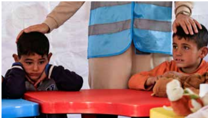
Children attend an activity to entertain and support the mental health of children affected by the deadly earthquake, at a camp for survivors in Adiyaman, Turkey