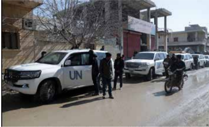
A convoy of the United Nations (UN) delegation is seen in the rebel-held town of Jandaris, in the aftermath of a deadly earthquake, in Syria