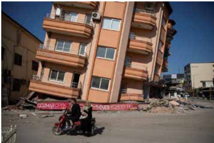
A man and a woman holding a baby ride a scooter past a destroyed building in the aftermath of the deadly earthquake in Kirikhan, Hatay province, Turkey