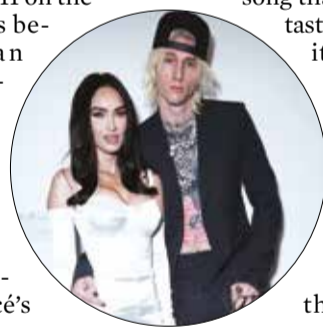
Megan Fox, Machine Gun Kelly

In the latest 411 on the split rumors between Megan Fox and Machine Gun Kelly, the actress reportedly found a few eyebrow-raising correspondences on her fiancé's phone. After doing a little snooping, Megan came upon “DM's and text messages” that led her to “believe he has been having an affair,” per Page Six. The alleged discovery came before she deleted her Instagram on Feb. 12 after posting a