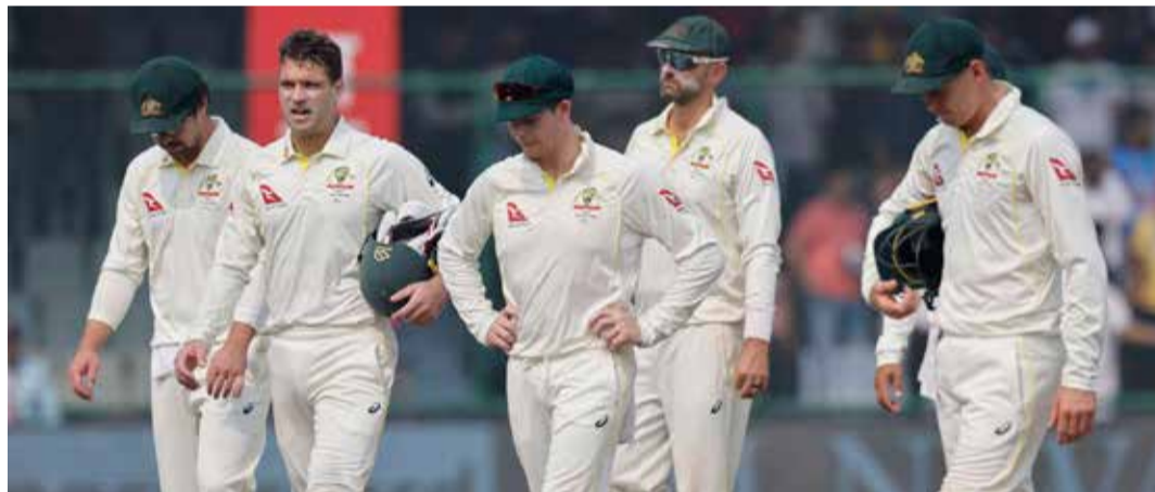
Australia players look dejected after the match

Jadeja, a left-arm orthodox, teamed up with fellow spinner Ravichandran Ashwin to dismiss Australia for 113 in a morning session when the tourists' batting imploded, thanks to an overused sweep shot on a tricky New Delhi pitch. The hosts romped to their victory target of 115 in the second session to guarantee them retention of the Border-Gavaskar trophy in the four-match series. They have won their previous three series against Australia and are now close to securing a spot in the World Test Championship final. India lost skipper Rohit Sharma, run out after a fluent 31, and Virat Kohli, who surpassed 25,000 international runs, stumped on 20. But Cheteshwar Pujara stood firm with 31 in his landmark 100th Test to steer the team home with a winning four as