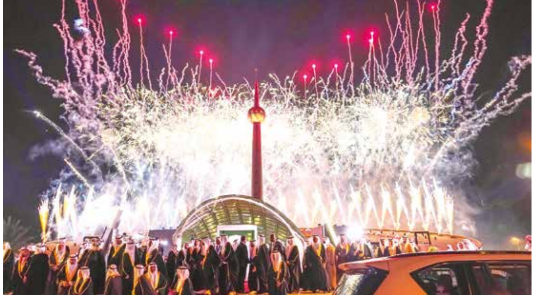
Colourful fireworks at the event

On behalf of HM King, HRH Prince Salman attends celebration in honour of HH Shaikh Nasser