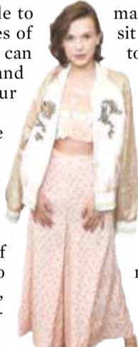
Millie Bobby Brown

important to be able to have that 10 minutes of your day so that you can focus on yourself and give back what your soul needs. "So much of the day consists of work, work, work for me, so being able to take that 10 minutes out of my day to drink a bottle of water, sit down, do something I enjoy, play with my ani-