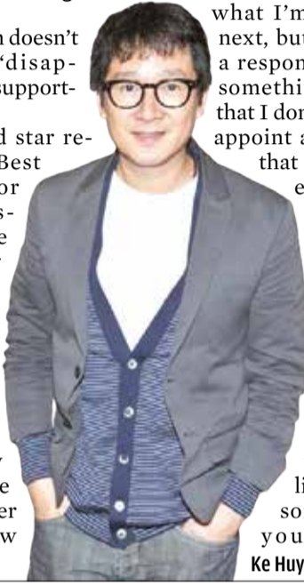
Ke Huy Quan

Ke Huy Quan doesn't want to "disappoint" his supporters. The 51-year-old star recently won the Best Supporting Actor gong at the Oscars for his role in 'Everything Everywhere All At Once', and he's now turning his focus towards the future. He told Variety: "I attended an event recently and sat next to Cate Blanchett. I told her that I don't know