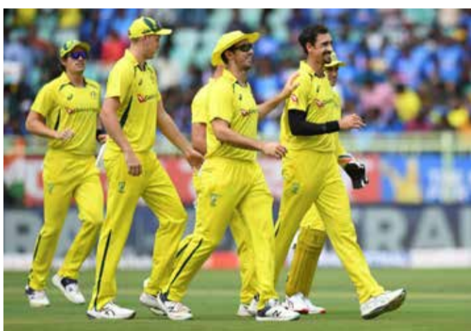
Australia's Mitchell Starc (R) celebrates with teammates after the dismissal of India's captain Rohit Sharma

Australia finished the chase with 39 overs to spare and bounce back from their opening defeat to hand India their biggest ODI loss in terms of balls remaining.