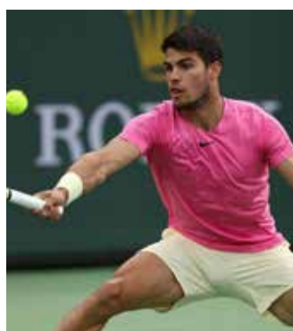
Carlos Alcaraz of Spain in action

With Alcaraz suddenly struggling, Sinner held for 5-4 and piled on the pressure with a set point at 6-5 that Alcaraz saved with a with a drop shot followed by a textbook volley winner.