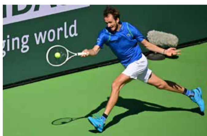
Daniil Medvedev hits a forehand return to Frances Tiafoe