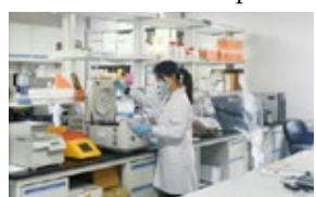
The team had been working "day and night" on the drug