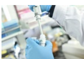
The new drug is being tested by scientists at China's Peking University

tralising antibodies can become a specialised drug that would stop the pandemic," he said.