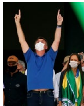
Brazilian President Jair Bolsonaro