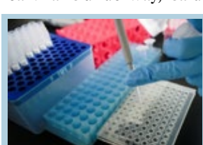
More than 100 vaccines for COVID-19 are in the works globally

"Planning for the clinical trial is underway," said