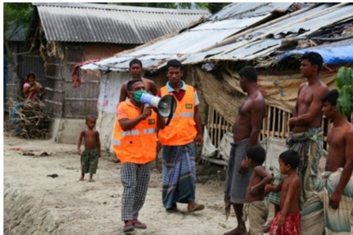
Bangladesh is aiming to evacuate more than two million people ahead of Cyclone Amphan

cial Manturam Pakhira said more than 200,000 people were being evacuated from coastal districts and the Sundarbans, a vast mangrove forest area.