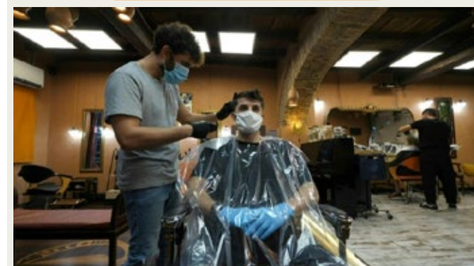
After hairdressers were allowed to reopen, some people in Italy could not wait to rush out and get their grey roots done or just a decent hair cut.