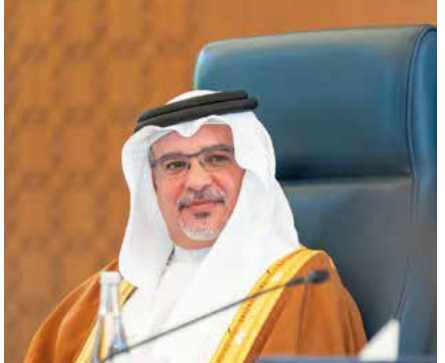
HRH the Crown Prince and Prime Minister chairs the weekly Cabinet meeting

Mohamed bin Zayed Al Nahyan, year. The annual publication Minister. Abu Dhabi. In this regard, the efforts to combat human traf-