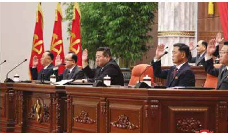
North Korean leader Kim Jong Un (C) attending the 8th Enlarged Plenary Meeting of the 8th Central Committee of the Workers' Party of Korea (WPK)