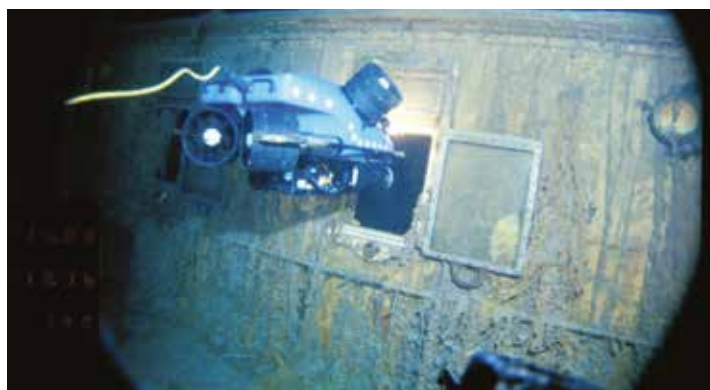
ROV (Remotely Operated Vehicle) Jason Jr. peers inside Titanic (file photo)

In a statement quoted by CBS News and other media outlets, OceanGate Expeditions said: "Our entire focus is on the crewmembers in the submersible and their families."