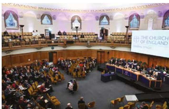
Members of the church attend the Church of England Synod, at Church House, in London

"While many will argue their work is a vocation, the simple truth is that on their current rewards they are among the