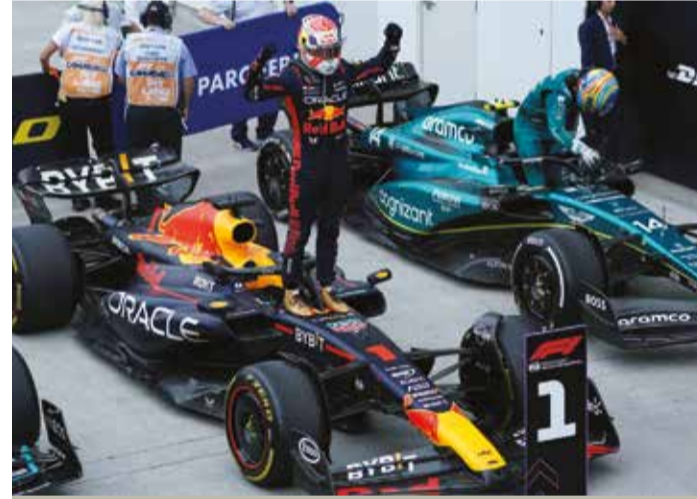
Red Bull Racing's Dutch driver Max Verstappen celebrates after winning

"It's amazing to get the team's 100th win here. I never expected to be on these kind of numbers for myself so we have to just keep enjoying it and work-