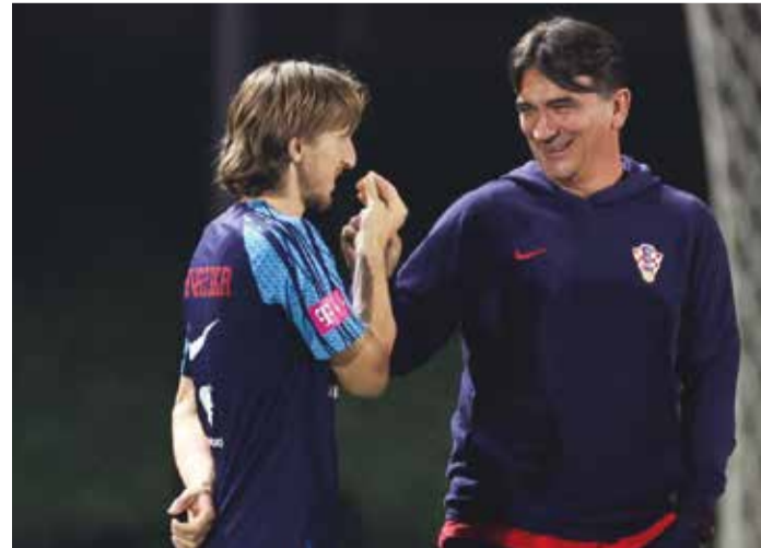
Croatia's Luka Modric (L) and coach Zlatko Dalic talk during a training session (file photo)

The Real Madrid player famously led Croatia to a second-place finish at the 2018 World Cup and third place at last year's tournament in Qatar.