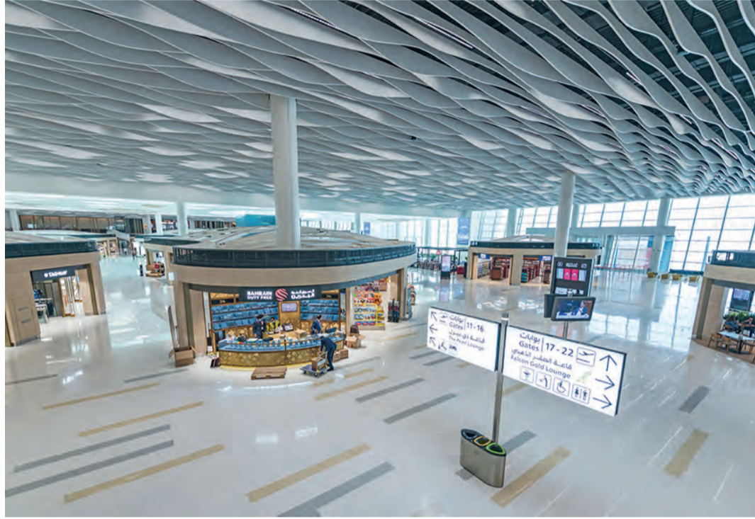
Bahrain International Airport

Windows PCs unexpectedly displayed the infamous "blue screen of death" error, rendering them unusable and causing