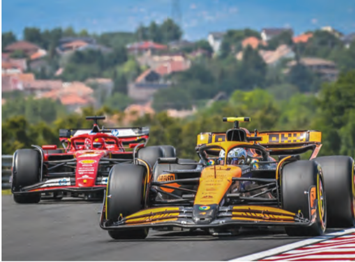
McLaren's British driver Lando Norris (R) drives during the first practice

McLaren's Lando Norris outpaced world champion Max Verstappen of Red Bull to top the times in yesterday's second free practice session, run in hot conditions, ahead of this weekend's Hungarian Grand Prix.