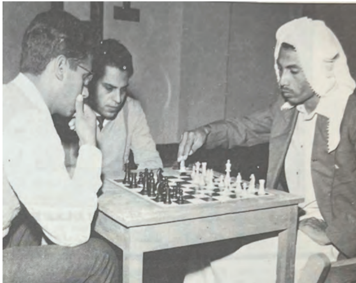
Chess match at Bahrain Chess Club in 1962