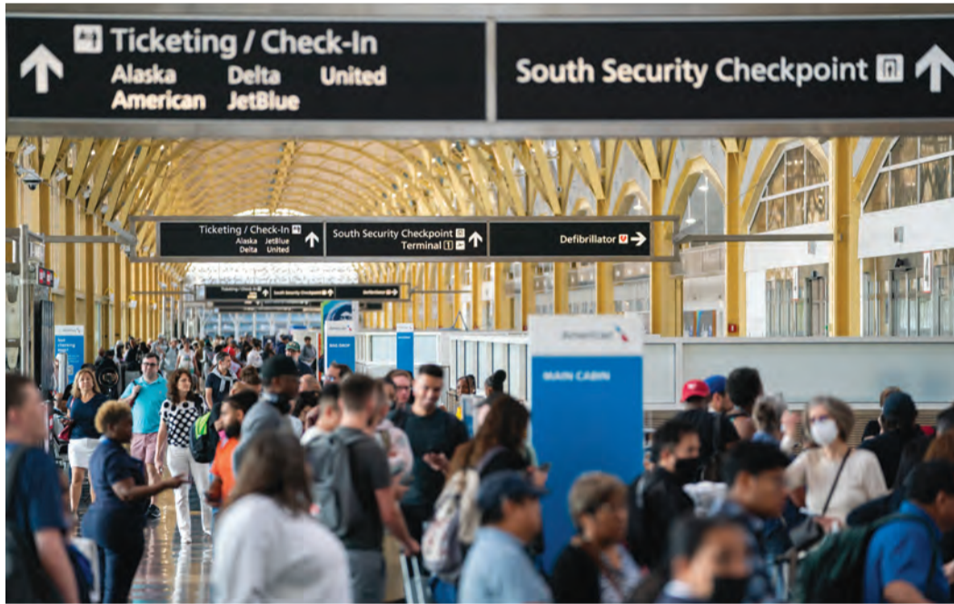
Travelers navigate customer service and ticketing lines at Ronald Regan Washington National Airport in Washington, DC.

Reports from the Netherlands and Britain suggested health services may have been affected by the disruption, meaning the full impact might not yet be known.