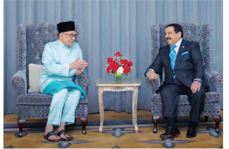
HM the King receives Malaysian Prime Minister Anwar Ibrahim