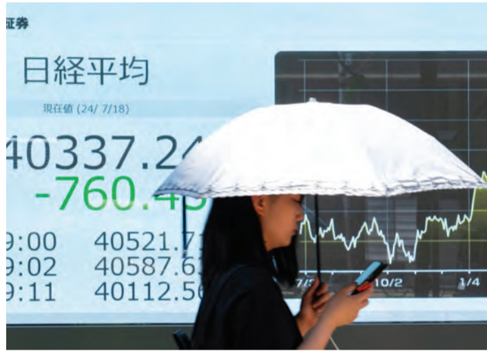
A woman walks past an electronic board displaying the numbers of the Tokyo Stock Exchange share price in Tokyo

down 0.7% approaching midday. Wall Street's main stock indices tried to push higher in morning trading but failed to hold onto gains.