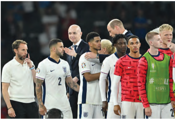
England's head coach Gareth Southgate and players greet Britain's Prince William after the UEFA Euro 2024 final match

The Football Association have identified a "number of candidates" to replace Gareth Southgate as they search for an England manager capable of "winning a major tournament".