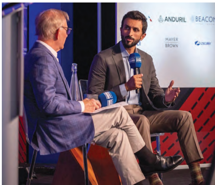
HH Shaikh Nasser speaks at the event

HH Shaikh Nasser highlights Kingdom's leadership in regional peace efforts at Aspen Security Forum