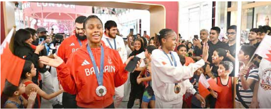
A red-carpet welcome for Olympic heroes

Bahrain's Olympic medal winners receive spectacular reception from enthusiastic crowds