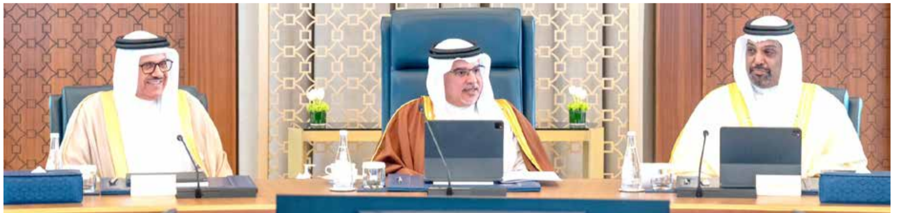
HRH the Crown Prince and Prime Minister chairs the weekly Cabinet meeting

Cabinet commends Bahrain Olympic team's historic achievements in Paris