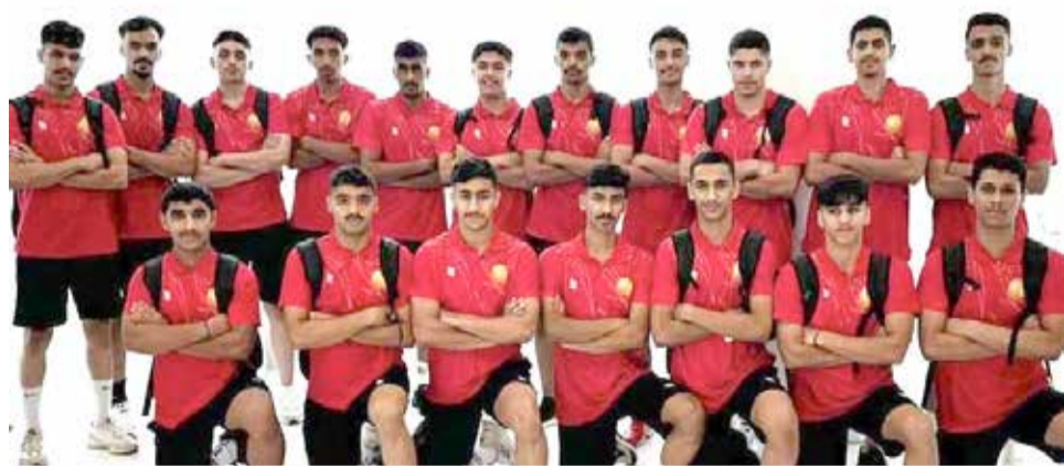
Bahrain junior handball team