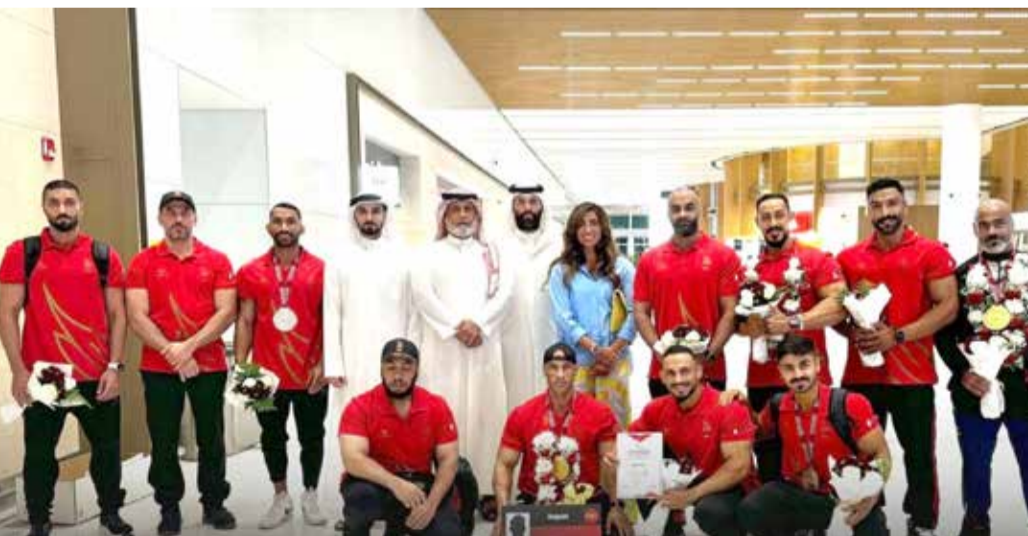
BOC officials with the national bodybuilding team

The athletes were honored with a reception full of flowers