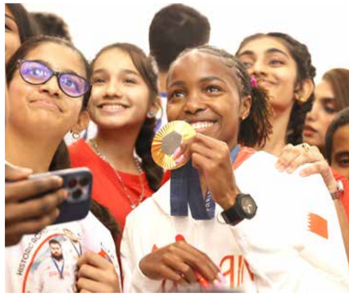
Gold medal winner Winfred Mutile Yavi posing for a picture with fans

"We expected a strong turnout, but the crowd at this reception exceeded all expectations. It shows the immense love and pride the people have for Bahrain's Olympic medalists," he said. Looking ahead to the 2028 Olympics, Al Kooheji shared Bahrain's clear vision for continued success.