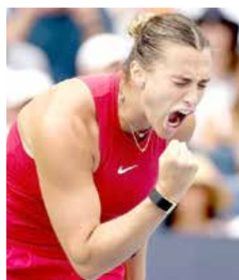
Aryna Sabalenka celebrates her winning match point

Sabalenka had a battle on her hands to close out her win, with Swiatek putting up a huge battle in the closing stages.