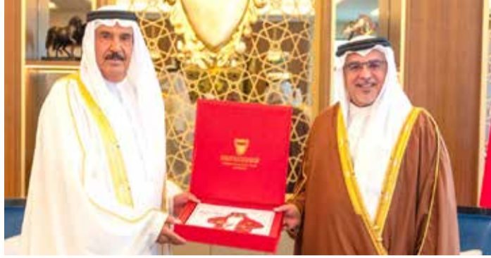
HRH the Crown Prince and Prime Minister receives a memento from H.E. Shaikh Duaij bin Salman Al Khalifa

The Minister of Finance and National Economy, H.E. Shaikh Salman bin Khalifa Al Khalifa,