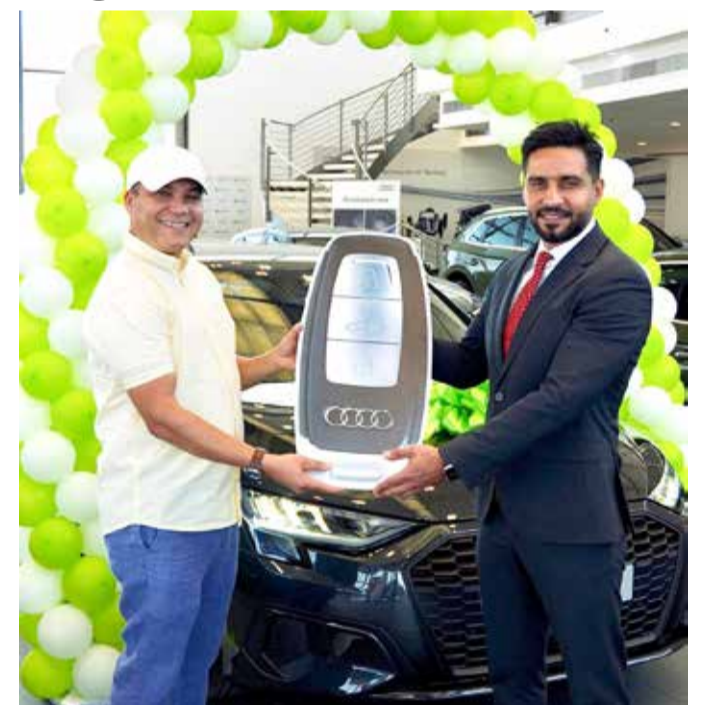
The award ceremony