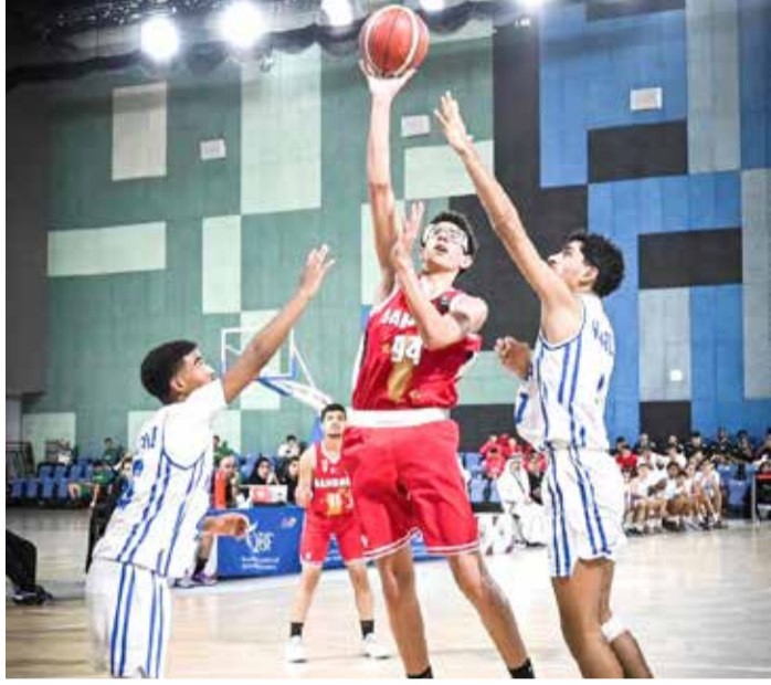
Action from the game

B ahrain's U15 basketball team has ushered in a new era of champions, adding