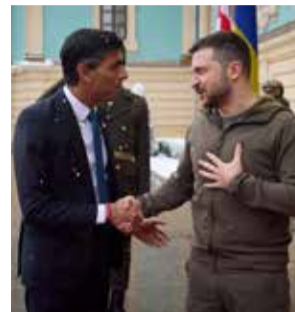
Volodymyr Zelenskyy shakes hands with Rishi Sunak | Kyiv

Britain's new Prime Minister Rishi Sunak made his first visit to Kyiv yesterday, pledging to continue the firm support for Ukraine that was a focus of his predecessors, and providing a new air defence package to help shoot down Russian drones.