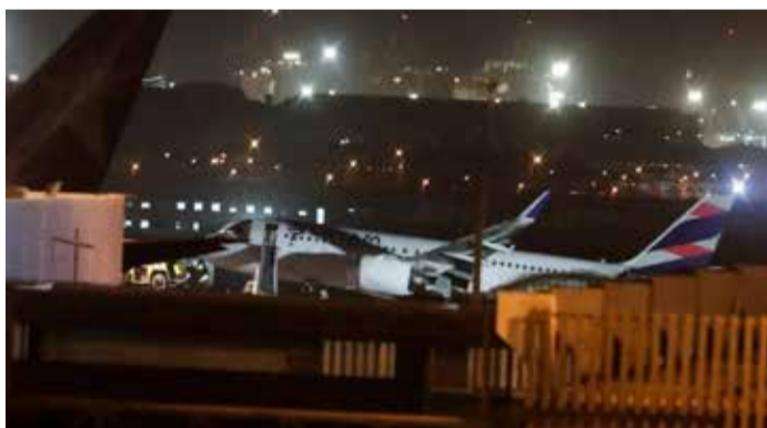
The LATAM Airlines plane is seen in Lima airport after the collision

President Pedro Castillo expressed condolences to the families of the two firefighters in a statement on Twitter, saying he was praying for the recovery of those injured.