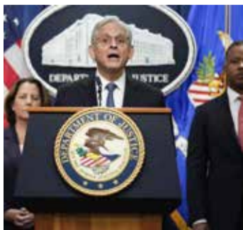
Attorney General Merrick Garland announces the special counsel in 2024. Garland said Trump's candidacy, as well as Demo-

Garland's announcement came three days after Trump, a Republican, announced he would run for president again