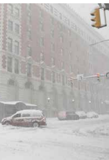
Blizzards in Buffalo, New York