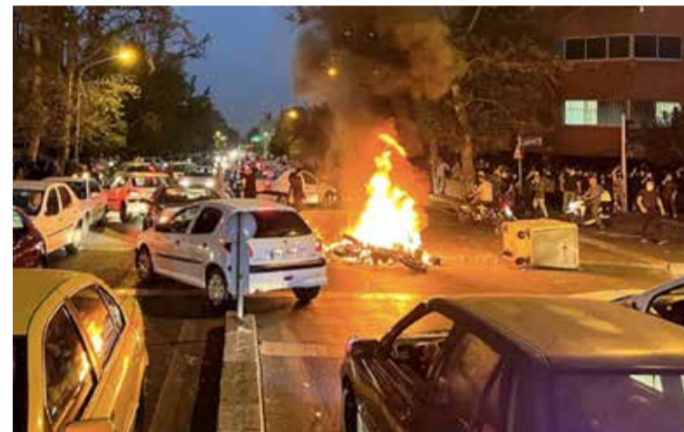
A motorcycle on fire during a protest in Iran (file photo)

Police on protester's family, seize body