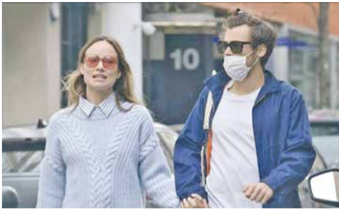
Olivia Wilde and Harry Styles