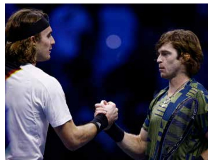
Andrey Rublev shakes hands with Stefanos Tsitsipas after winning the match | Turin

Andrey Rublev said he disagrees with Stefanos Tsitsipas' assessment of him as a player with "few tools" following a come-from-behind victory over the Greek in the ATP Finals on Friday.