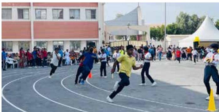
Action from a relay