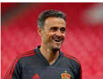
Spain coach Luis Enrique

Luis Enrique, who coached Messi and Suarez in a successful stint with Barcelona from 2014 to 2017, said that the forwards deserved to retire with a world