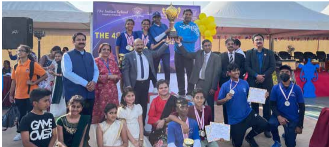
Overall champions receive the trophy from school officials