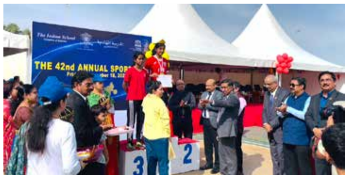
Winners of an event receive their medals and certificates