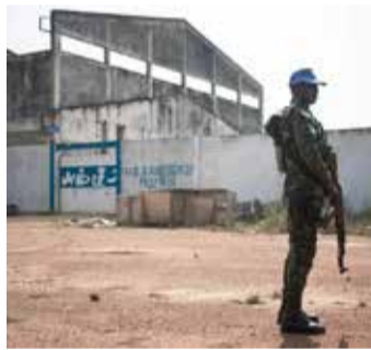
A soldier stands in front of a destroyed Chinese mining building (file photo)

Matchipata said that "nine bodies and two wounded" had been counted, adding that the victims were Chinese workers at a site run by the Gold Coast