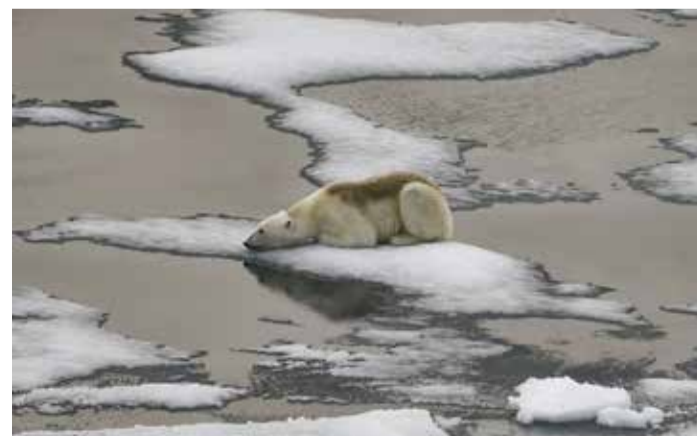
A polar bear on melting ice floes in Russia's Franz Josef Land archipelago

"Humanity is on thin ice -- and that ice is melting fast," the United Nations chief said in a video message as the IPCC experts group issued its latest report, which he likened to "a survival guide for humanity."