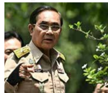
Thailand’s Prime Minister Prayut Chan-O-Cha speaks to press

Thai group, fronted by Paetongtarn Shinawatra, is polling strongly but Thailand’s junta-scripted 2017 constitution will make it hard for the party to secure the top job.