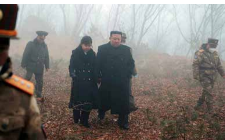
North Korea’s leader Kim Jong Un (centre R) and his daughter (centre L) walking together as they attend a warhead missile launch exercise