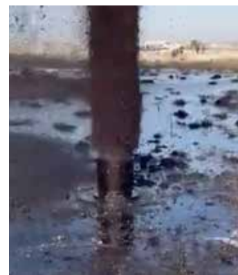
Screenshot from a video posted by Kuwaiti media shows a gushing pipe surrounded by a large slick of oil

but not in a residential area”, he later said.