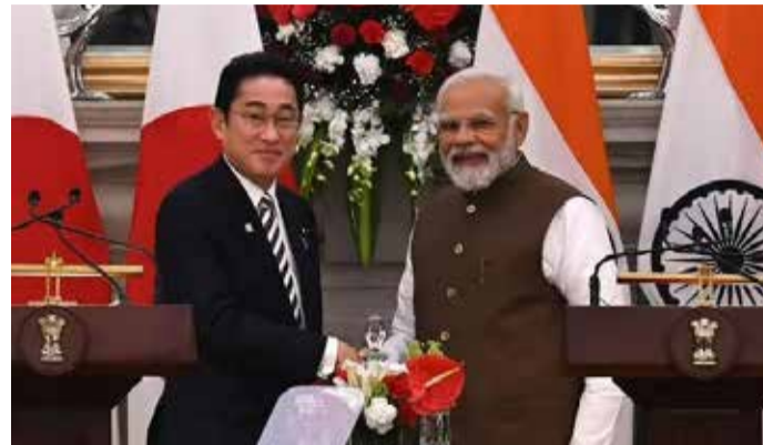
Japan’s Prime Minister Fumio Kishida (L) shakes hands with his Indian counterpart Narendra Modi after attending a joint media briefing

Japan is also boosting military spending and is carrying