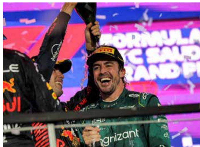
Winner Red Bull Racing's Mexican driver Sergio Perez celebrates with Aston Martin's Spanish driver Fernando Alonso on the podium

The stewards judged that a mechanic touched the car with a rear tyre jack before the five seconds had elapsed and so the penalty had not been served