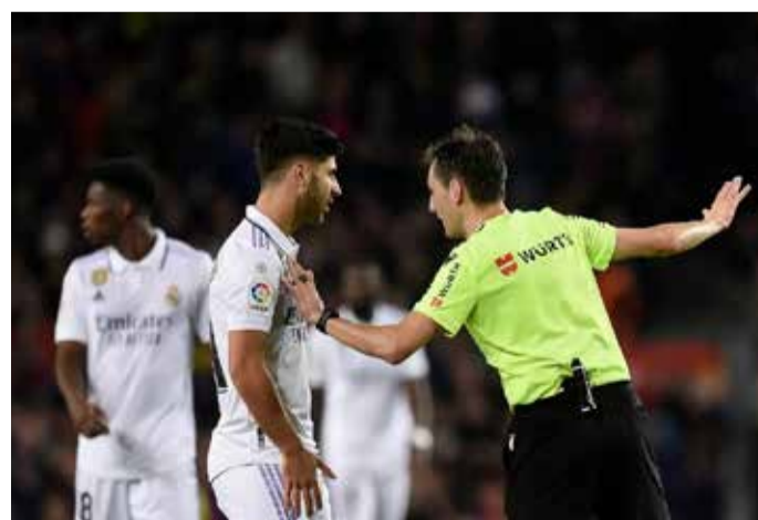
Spanish referee Ricardo De Burgos Bengoetxea (R) talks to Real Madrid's Spanish midfielder Marco Asensio after annulling his goal following a VAR decision

"We did not win because of an offside that we're still doubtful about," Ancelotti told reporters. "It was not so sure. We have