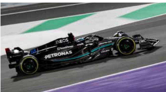
Mercedes' British driver Lewis Hamilton competes during the race