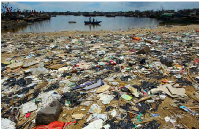
A rubbish-strewn beach in Anquan village, south China's Hainan province

An international team of scientists identified plastic-eating bacteria and fungi in Chinese coastal salt marshes, presenting new possibilities for global waste management, according to a study published Thursday.