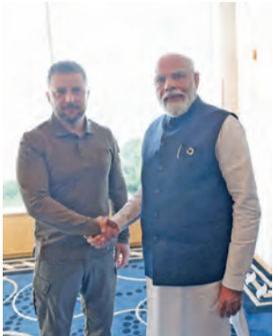
Zelensky meets G7 as Ukraine wins access to F-16s Hiroshima, Japan

Ukraine President Volodymyr Zelenskyy huddled with G7 leaders on a landmark visit to Hiroshima yesterday, securing long-sought access to US fighter jets and mounting a diplomatic offensive.