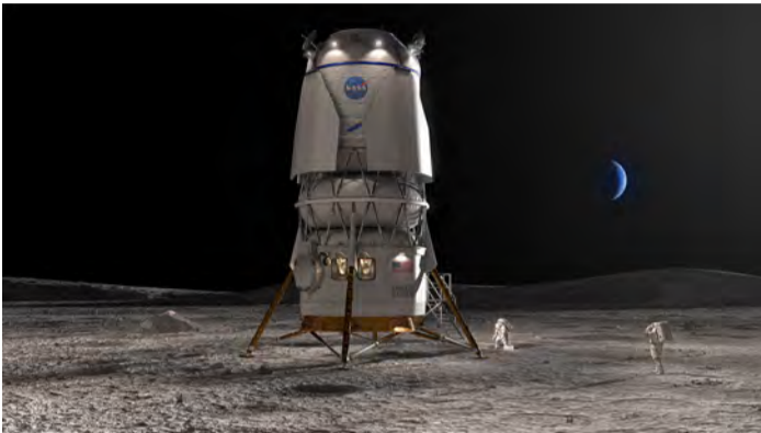
An artist's concept depicts the Blue Origin's Blue Moon lander that will return astronauts to the Moon as part of NASA's Artemis programme

Bezos, the founder and former CEO of Amazon, said on Twitter he was "honoured to