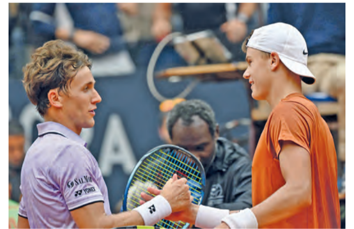
Denmark's Holger Rune (R) shakes hand with Norway's Casper Ruud