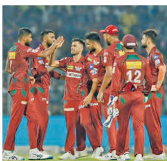
Ravi Bishnoi celebrates after a wicket

They ended with 17 points, tied with Chennai Super Kings, but LSG's inferior net run rate meant they finished third. They