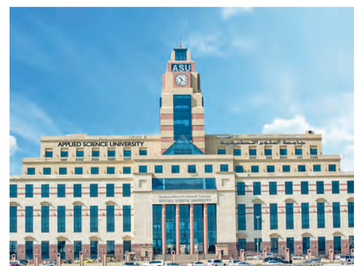
A general view of ASU

Students also benefit greatly from the CIOB's accreditation. They gain free access to CIOB's