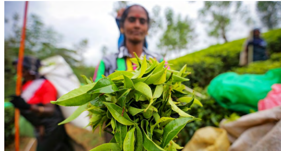
A tea plantation worker shows off plucked tea leaves in the Nuwara Eliya district of Sri Lanka