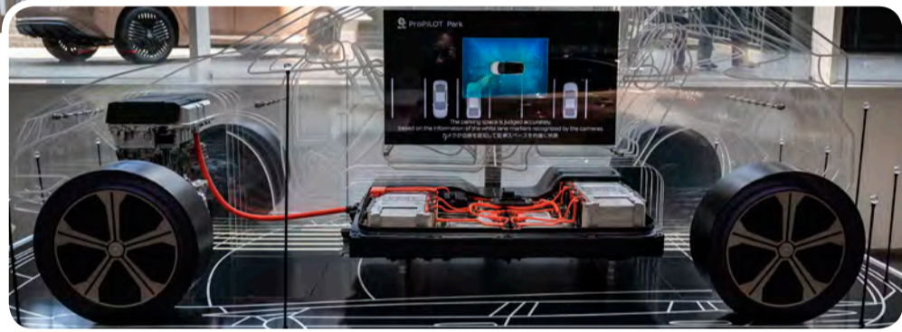
A cutaway display of the battery and engine system of one of Nissan's electric vehicles (EV) at the global headquarters of Japanese automaker Nissan Motor in Yokohama, Kanagawa prefecture.

development goals 2030. The move come close on the heels of the announcement of a deal by Gauss Auto Bahrain to set up the Kingdom's first electric car factory to produce a range of vehicles including two- and three-wheel electric tri-cycles and passenger vehicles.