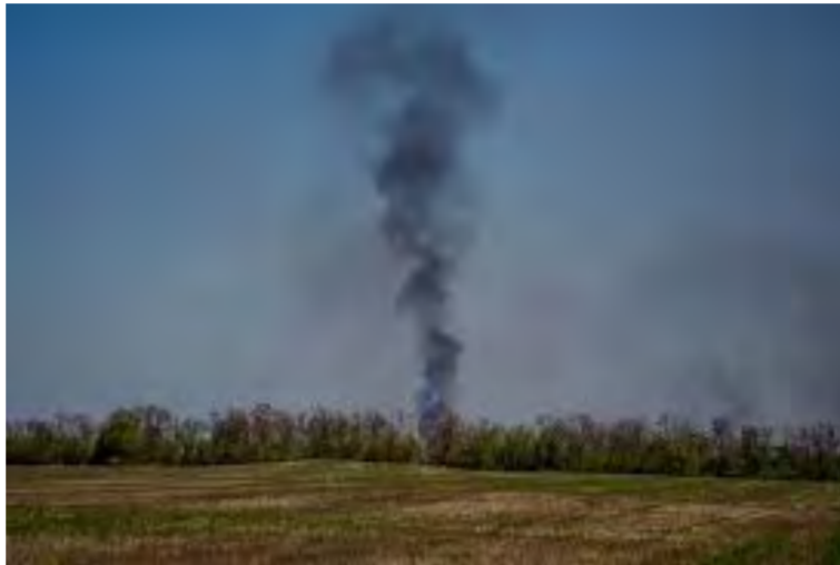
Smoke billows from the frontline city of Bakhmut (file photo)

The announcement by Wagner came as Ukrainian President Volodymyr Zelensky took part in the G7 summit in Japan.