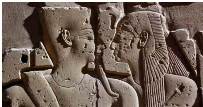
A carving at Luxor Temple in Egypt depicting Pharaoh Ramses and Queen Nefertiti embracing