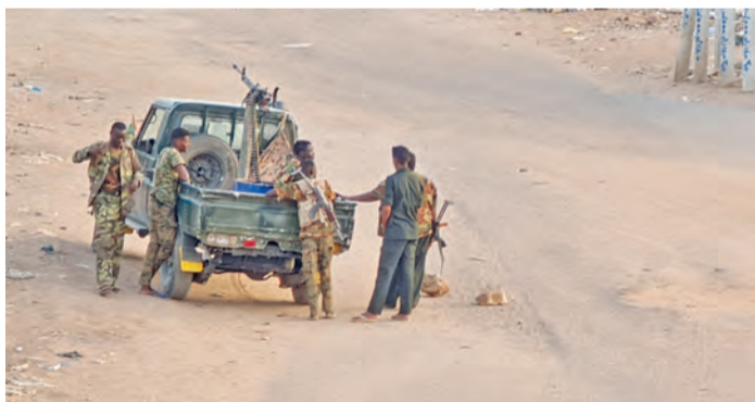
Soldiers of the Sudanese army stand near their vehicle on a road blocked with bricks in Khartoum

The power struggle between regular army chief Abdel Fattah al-Burhan and his former deputy