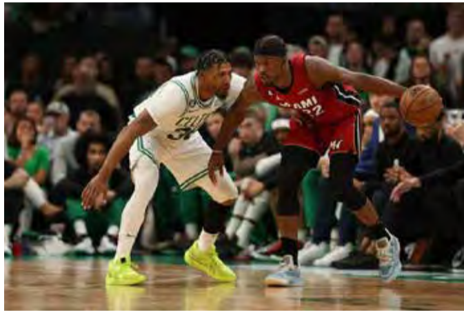
Jimmy Butler #22 of the Miami Heat is guarded by Marcus Smart #36 of the Boston Celtics