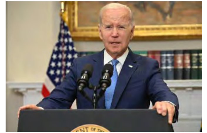
Biden Hiroshima, Japan

The sight of a tired-looking top White House domestic policy adviser in a Hiroshima hotel said it all: President Joe Biden may be on the other side of the world but his political fight back home over the debt ceiling has followed him.