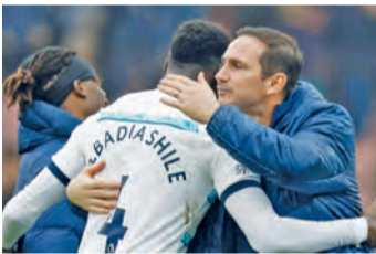
Chelsea's Benoit Badiashile (C) celebrates with interim manager Frank Lampard

the fifth time in six seasons that Pep Guardiola's team have been crowned champions of England.