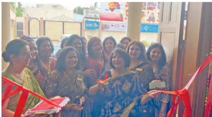
In pictures, the inauguration and other events at the Bazaar held at Bahrain Keraleeya Samajam

Established in 1956, the ILA has been actively promoting Indian culture and fostering community bonds. The Anand Bazaar held their first fun event in 1973. This year's fair had diverse products ranging from Bahraini and Indian handicrafts to clothing, jewellery, cuisine, books, skincare products, games, and shipping services.