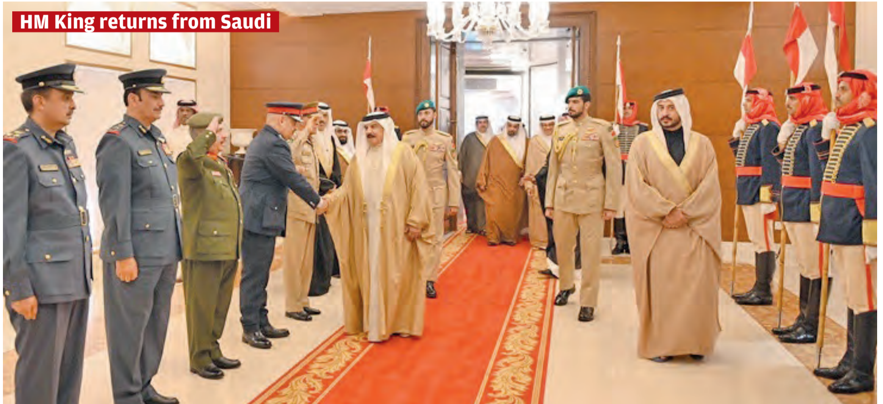
His Majesty King Hamad bin Isa Al Khalifa returned to Bahrain yesterday after leading the kingdom's delegation to the 32nd Arab Summit, which took place in Jeddah, Saudi Arabia. The departure ceremony at King Abdulaziz International Airport in Jeddah was attended by high-ranking Saudi Royals and officials, who bid farewell to King Hamad.