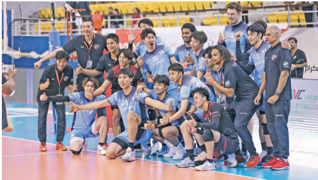
Suntory Sunbirds team members celebrate after their win against Shahdab Yazd

Both the Sunbirds and Bhayangkara are now looking to