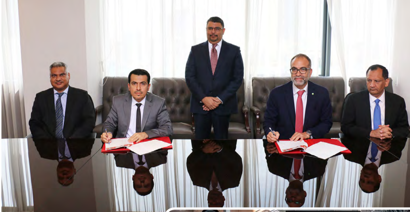
Officials during the deal signing

The aim is to increase the deployment of renewable en-