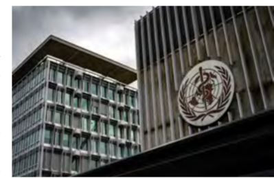
A sign of the World Health Organization (WHO) and their headquarters in Geneva

WHO chief Tedros Adhanom Ghebreyesus hailed the "ambitious" goals of the new network, saying it could "play a vital role in health security".