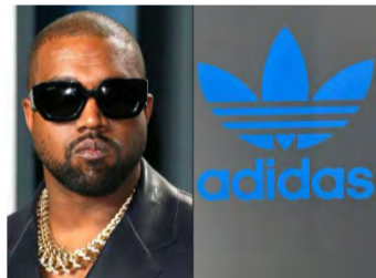
Kanye West attending the 2020 Vanity Fair Oscar Party in Beverly Hills

It said only that "a range of existing designs will be available