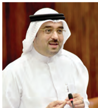
MP Ahmed Al-Salloom