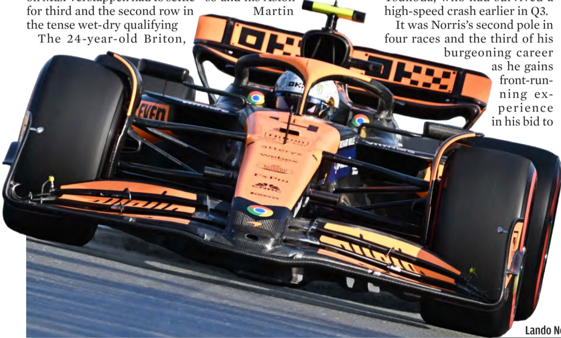
Lando Norris in action

All this left Norris and Verstappen to scrap for pole, as rain was forecast, and the Dutchman led them out to clock 1:15.555 before Norris cut that time by 0.328 with his lap in 1:15.227. It was provisional pole, as rain began to fall.