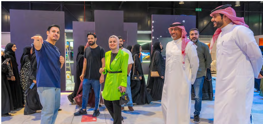
H.E. Rawan bint Najeeb Tawfiqi visits the Bahrain International Exhibition Centre to inspect the preparations

Morning sessions are designed for ages 9 to 14, while evening programmes target those aged 15 to 35. The city features five centres, each offering professionally crafted training programmes aimed at identifying and nurturing Bahraini youth talents to