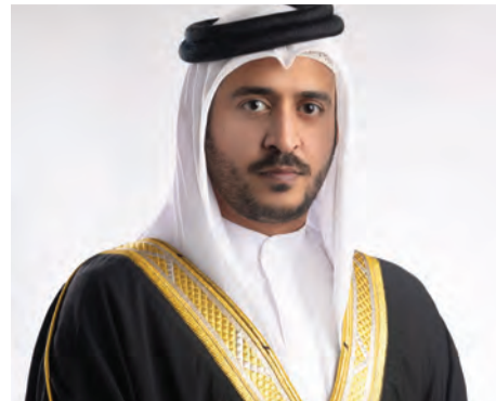
His Highness Shaikh Nasser bin Hamad Al Khalifa