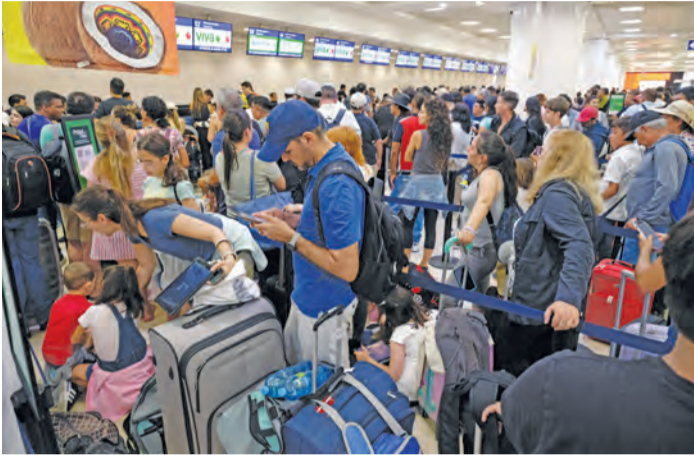
Passengers wait for their flights at the Cancun airport in Quintana Roo state, Mexico