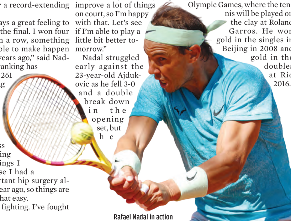
Rafael Nadal in action

Nadal is using the event in Bastad as a tune-up for the Olympic Games, where the tennis will be played on the clay at Roland Garros. He won gold in the singles in Beijing in 2008 and gold in the doubles at Rio 2016.