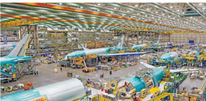
Boeing 777 freighters and 777X are built at the Everett Production Facility in Everett, Washington

The dual-aisle plane, first announced in 2013, has a wingspan of 72 meters and a maximum length of 77 meters, which will make it the biggest dual-en-