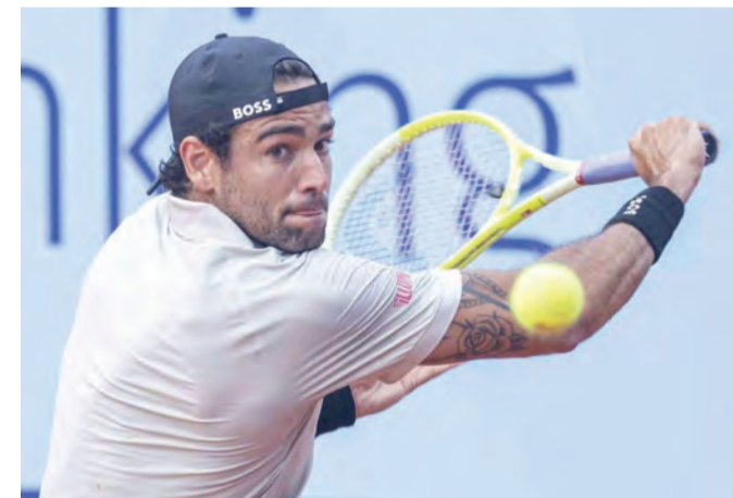
Matteo Berrettini in action