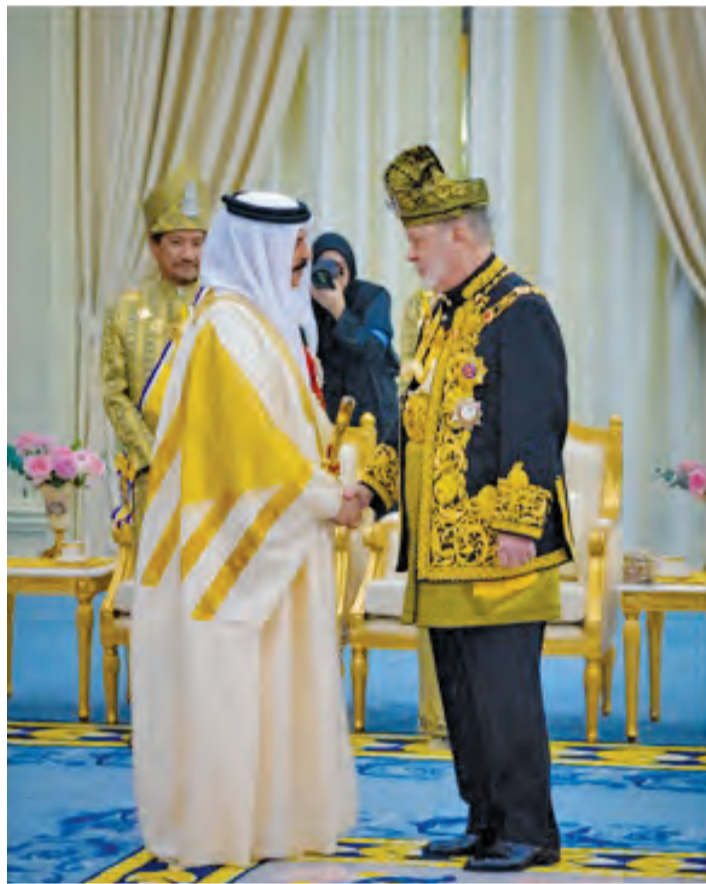
TDT | Kuala Lumpur

His Majesty King Hamad bin Isa Al Khalifa reaffirmed his commitment to ongoing collaboration with His Majesty the King of Malaysia, Sultan Ibrahim ibni Sultan Iskandar.