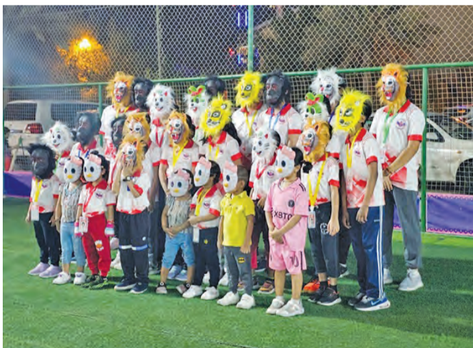
Participants pose for a photo

Parents and students displayed impressive skills, hitting boundaries and bowling