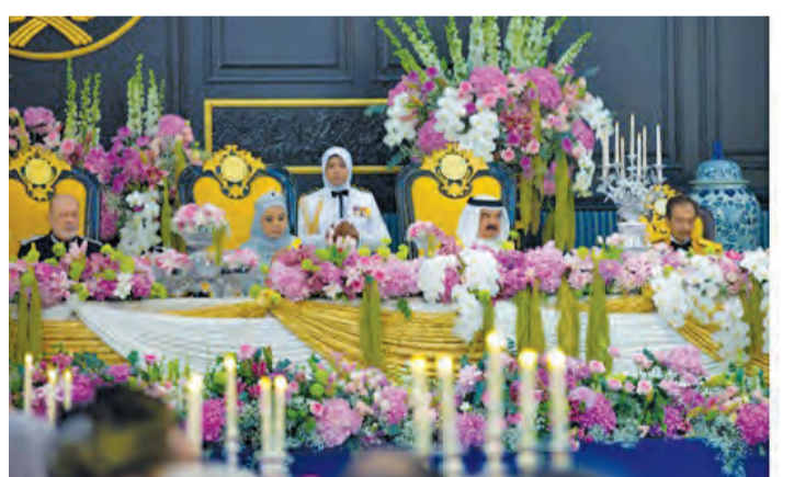
HM the King with HM Sultan Ibrahim at the installation ceremony and dinner banquet