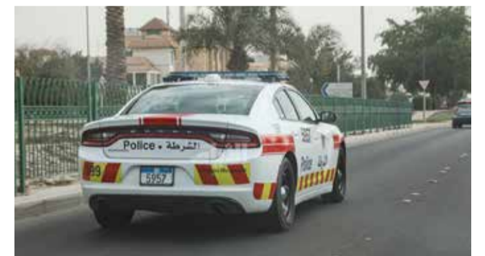
Representative picture

● The arrest followed a video clip of the stunt went viral on social media sites