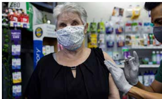
A woman receives the Pfizer-BioNTech coronavirus disease (COVID-19) vaccine as a booster dose

pattern of decline we are seeing will continue in the months ahead, which could lead to reduced protection against severe disease, hospitalization, and death."