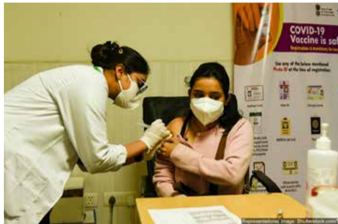
A woman receives coronavirus disease (COVID-19) vaccine in Mumbai

The generic drugmaker, listed as Cadila Healthcare Ltd, aims to make 100 million to 120 mil-